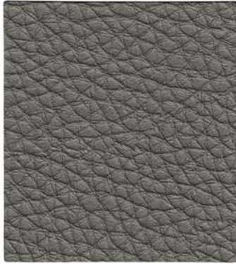
Bravo II Graystone