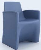
Hardi Dining with Arms