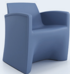
Hardi Lounge with Arms