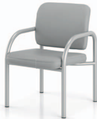
Separate seat and back. Features zipper-removable seat covers.