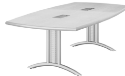
ARK DOUBLE COLUMN WITH PERFORATED DOOR FOR WIRE MANAGEMENT