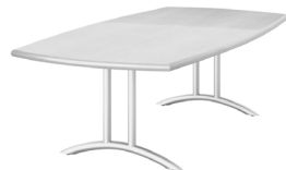
ARK DOUBLE COLUMN