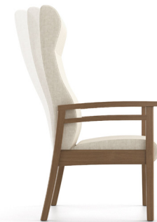
6501HR 35 lbs

Exceeds BIFMA Seating Durability Test to 350 lbs per seat CAL 133, add $116 List per seat