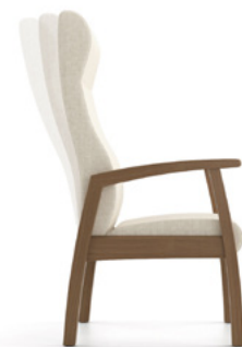
6401HR 35 lbs

Exceeds BIFMA Seating Durability Test to 350 lbs per seat CAL 133, add $116 List per seat