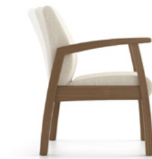
6401MR 30 lbs

Exceeds BIFMA Seating Durability Test to 350 lbs per seat CAL 133, add $106 List per seat