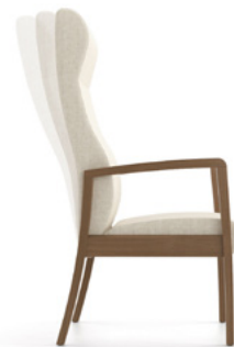
6701HR 35 lbs

Exceeds BIFMA Seating Durability Test to 350 lbs per seat CAL 133, add $116 List per seat