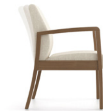
6701MR 30 lbs

Exceeds BIFMA Seating Durability Test to 350 lbs per seat CAL 133, add $106 List per seat