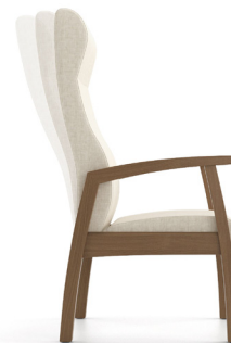
6401HR 35 lbs

Exceeds BIFMA Seating Durability Test to 350 lbs per seat CAL 133, add $123 List per seat