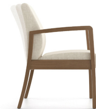
6701MR 30 lbs

Exceeds BIFMA Seating Durability Test to 350 lbs per seat CAL 133, add $113 List per seat