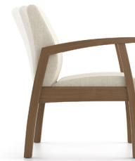
6401MR 30 lbs

Exceeds BIFMA Seating Durability Test to 350 lbs per seat CAL 133, add $113