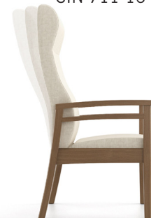
6501HR 35 lbs

Exceeds BIFMA Seating Durability Test to 350 lbs per seat CAL 133, add $123 List per seat