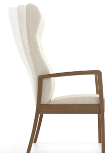
6701HR 35 lbs

Exceeds BIFMA Seating Durability Test to 350 lbs per seat CAL 133, add $123 List per seat