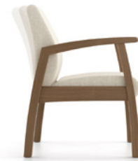
6401MR 30 lbs

Exceeds BIFMA Seating Durability Test to 350 lbs per seat CAL 133, add $115 List per seat