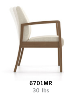
6701MR 30 lbs

Exceeds BIFMA Seating Durability Test to 350 lbs per seat CAL 133, add $115 List per seat