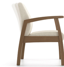
6401MR 30 lbs

Exceeds BIFMA Seating Durability Test to 350 lbs per seat CAL 133, add $115 List per seat