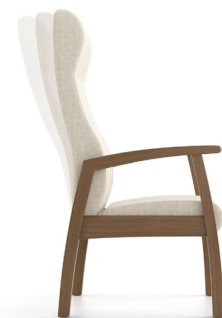
6401HR 35 lbs

Exceeds BIFMA Seating Durability Test to 350 lbs per seat CAL 133, add $125 List per seat