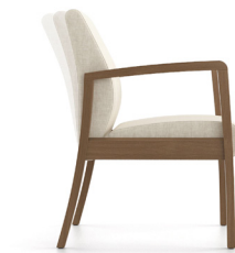
6701MR 30 lbs

Exceeds BIFMA Seating Durability Test to 350 lbs per seat CAL 133, add $115 List per seat