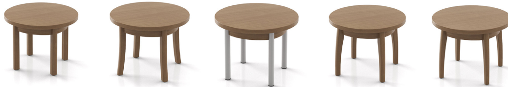
Bala Bracebridge Dwight Huntsville Midland