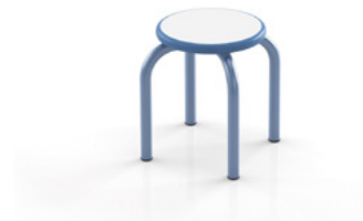
4001 10 lbs

seat H 14.0 seat W 12.0 arm H N/A total H 14.0 total W 14.0 depth 14.0