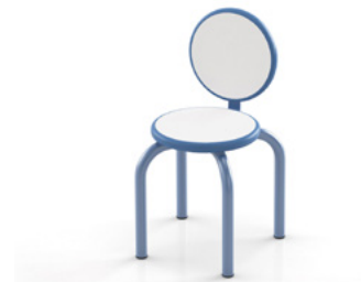
4002 16 lbs

seat H 14.0 seat W 12.0 back W 11.0 total H 26.0 total W 14.0 depth 16.0