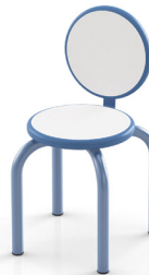
4002 16 lbs

Note: Products above pictured in non-standard laminate