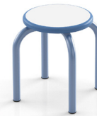
4001 10 lbs