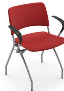
1724-UP With arms 19 lbs

Exceeds BIFMA Seating Durability Test to 500 lbs CAL 133, add $116 List 1/2" extra seat foam, specify and add $14 List