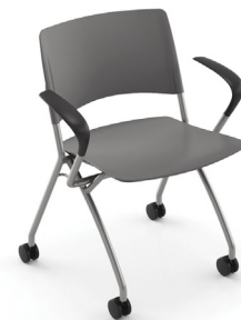
1725 With arms 19 lbs

Exceeds BIFMA Seating Durability Test to 500 lbs CAL 133, add $96 List