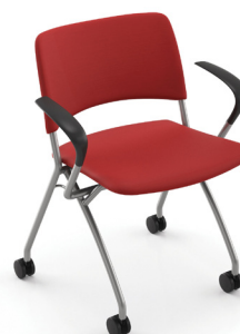
1725-UP With arms 19 lbs

Exceeds BIFMA Seating Durability Test to 500 lbs CAL 133, add $116 List 1/2" extra seat foam, specify and add $14 List