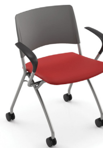
1725-US With arms 19 lbs

Exceeds BIFMA Seating Durability Test to 500 lbs CAL 133, add $106 List 1/2" extra seat foam, specify and add $14 List