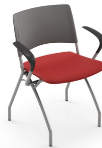
1724-US With arms 19 lbs

Exceeds BIFMA Seating Durability Test to 500 lbs CAL 133, add $106 List 1/2" extra seat foam, specify and add $14 List