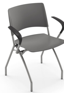
1724 With arms 19 lbs

Exceeds BIFMA Seating Durability Test to 500 lbs CAL 133, add $96 List