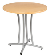
30D-FX4 CAFE HEIGHT