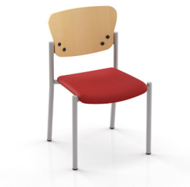
1905 9 lbs