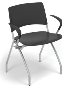
1704 With arms 22 lbs

Exceeds BIFMA Seating Durability Test to 500 lbs CAL 133, add $93 List