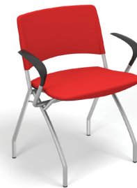
1704-UP With arms 22 lbs

Exceeds BIFMA Seating Durability Test to 500 lbs CAL 133, add $112 List