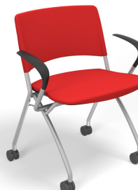
1705-UP With arms 22 lbs

Exceeds BIFMA Seating Durability Test to 500 lbs CAL 133, add $112 List