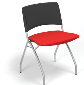
1714-US Without arms 20.5 lbs