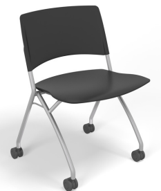
1715 Without arms 20.5 lbs