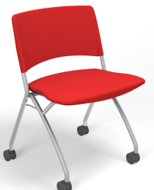
1715-UP Without arms 20.5 lbs