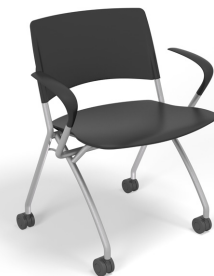
1705 With arms 22 lbs

Exceeds BIFMA Seating Durability Test to 500 lbs CAL 133, add $93 List