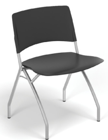
1714 Without arms 20.5 lbs