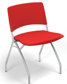
1714-UP Without arms 20.5 lbs