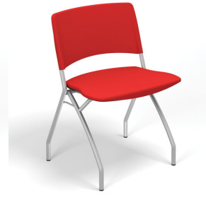
1714-UP Without arms 20.5 lbs