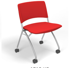
1715-UP Without arms 20.5 lbs