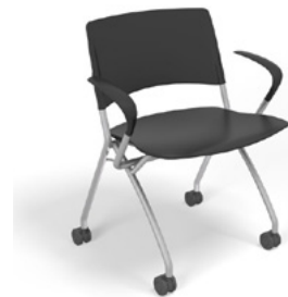
1705 With arms 22 lbs

Exceeds BIFMA Seating Durability Test to 500 lbs CAL 133, add $96 List