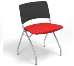
1714-US Without arms 20.5 lbs