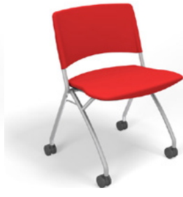
1715-UP Without arms 20.5 lbs