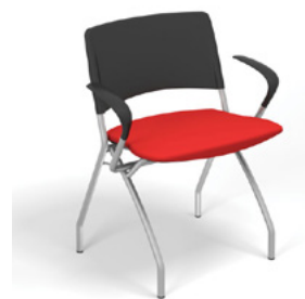
1704-US With arms 22 lbs

Exceeds BIFMA Seating Durability Test to 500 lbs CAL 133, add $106 List 1/2" extra foam, specify and add $21 List