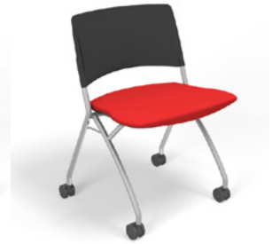
1715-US Without arms 20.5 lbs