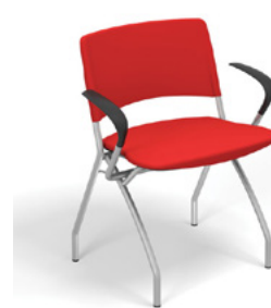
1704-UP With arms 22 lbs

Exceeds BIFMA Seating Durability Test to 500 lbs CAL 133, add $115 List 1/2" extra foam, specify and add $21 List