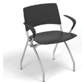
1704 With arms 22 lbs

Exceeds BIFMA Seating Durability Test to 500 lbs CAL 133, add $96 List