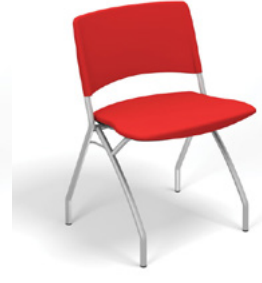
1714-UP Without arms 20.5 lbs