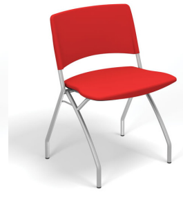
1714-UP Without arms 20.5 lbs