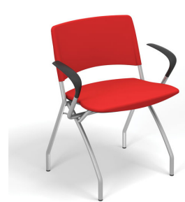
1704-UP With arms 22 lbs

Exceeds BIFMA Seating Durability Test to 500 lbs CAL 133, add $116 List 1/2" extra foam, specify and add $20 List