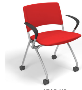
1705-UP With arms 22 lbs

Exceeds BIFMA Seating Durability Test to 500 lbs CAL 133, add $116 List 1/2" extra foam, specify and add $20 List