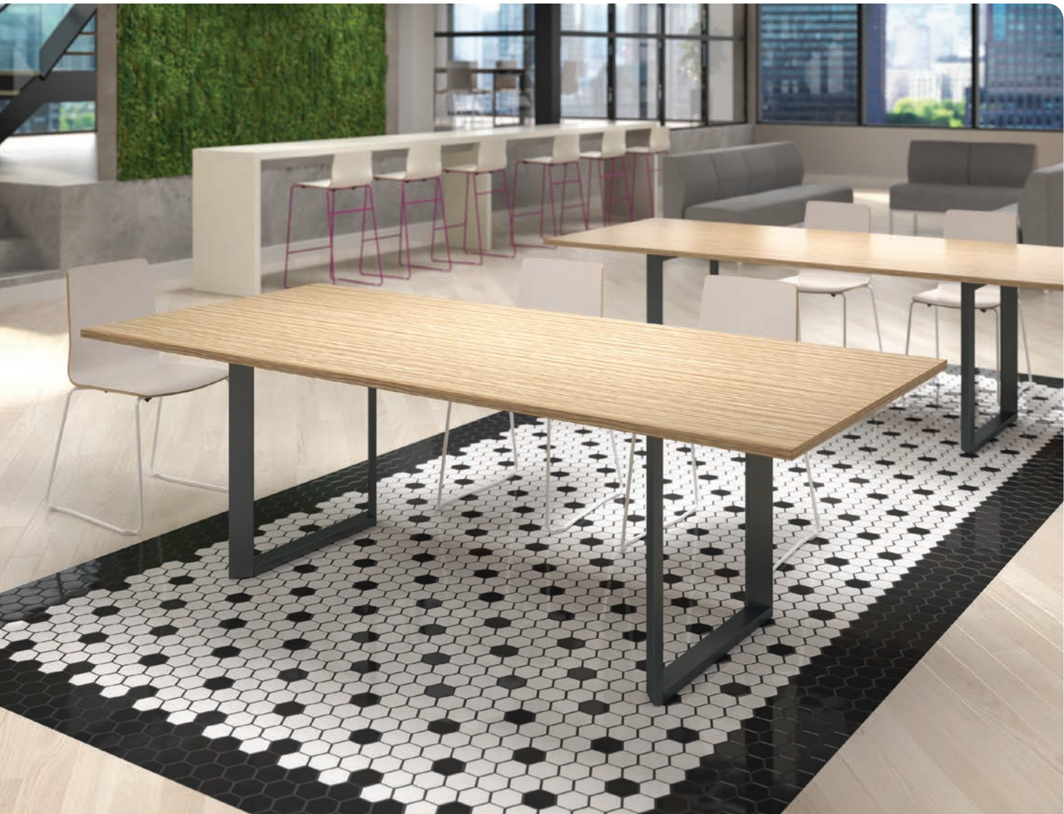
Askew Top Finish: Wilsonart, 7982-38 Buka Bark; Frame: RAL 7016. Jazzy (Dining Height) Shell: Wilsonart, D92-60 Dove Grey; Frame: RAL 9016. Jazzy (Bar Height) Shell: Wilsonart, D427-60 Linen; Frame: RAL 4006. EndZone Laminate (Outside): Wilsonart, D427-60 Linen; Laminate (Inside): Wilsonart, D92-60 Dove Grey. Tailor Booth Upholstery: Maharam, Mode Ominous; Frame: RAL 9016. Askew (Front Cover) Top Finish: Wilsonart, 8216K-28 Antique Marula Pine; Frame: RAL 9016.