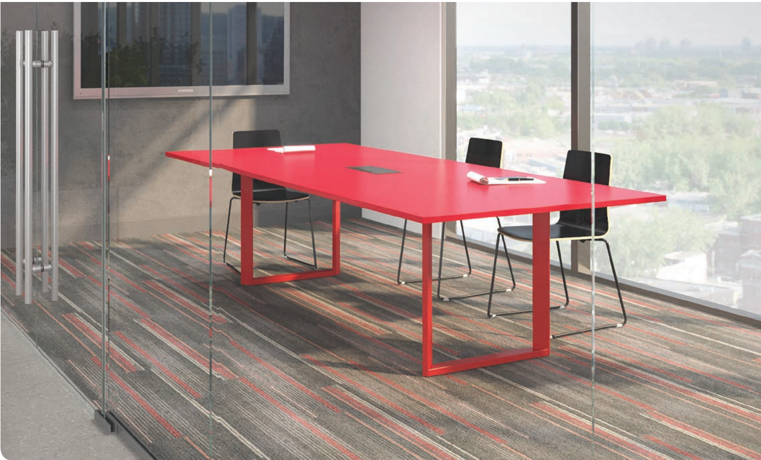
Askew Top Finish: Formica, 839-58 Stop Red; Frame: RAL 3002. Jazzy Shell: Wilsonart, 1595-60 Black; Frame: RAL 9005.

With 76 base colors, nine standard wood stains, stain-to-match at no upcharge, over a dozen edge styles and an endless selection of laminates, Askew is a designer's chance to make a mark where it matters.