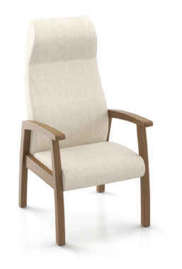
Huntsville Highback Rocker