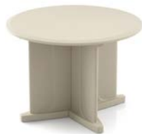
8851 Endurance X-Base Table, Floor Mount