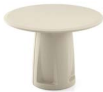
8850 Endurance Cylinder-Base Table, Floor Mount