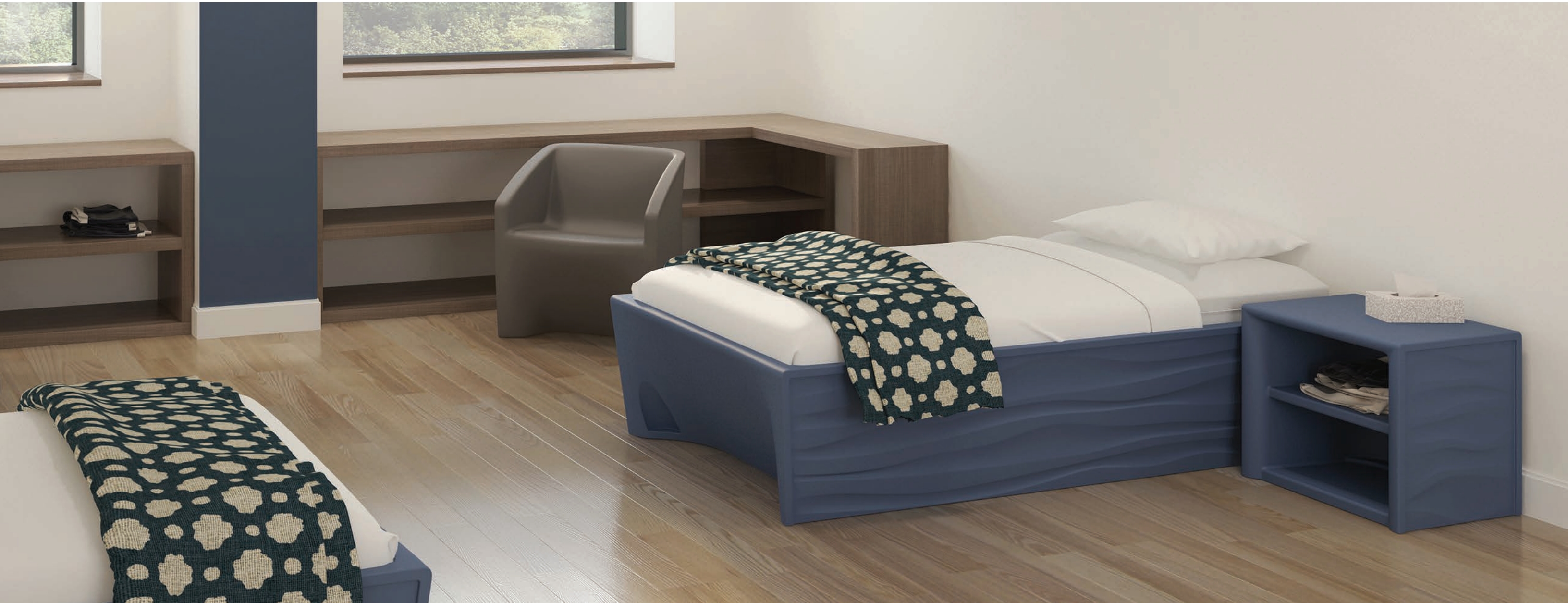
Hardi Bed Finish: RAL 5014. Hardi Bedside Table Finish: RAL 5014. Hardi Club Finish: RAL 7006.