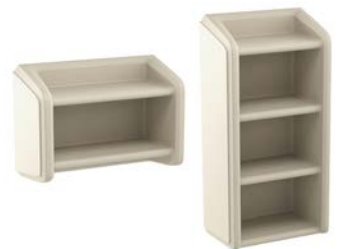
8910, 8911 Endurance Shelves, Wall Mount