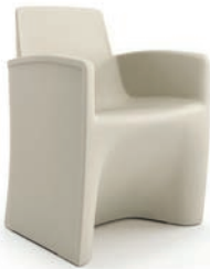
Hardi Dining with Arms