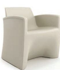
Hardi Lounge with Arms