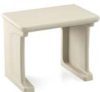
8852 Endurance Desk, Floor Mount