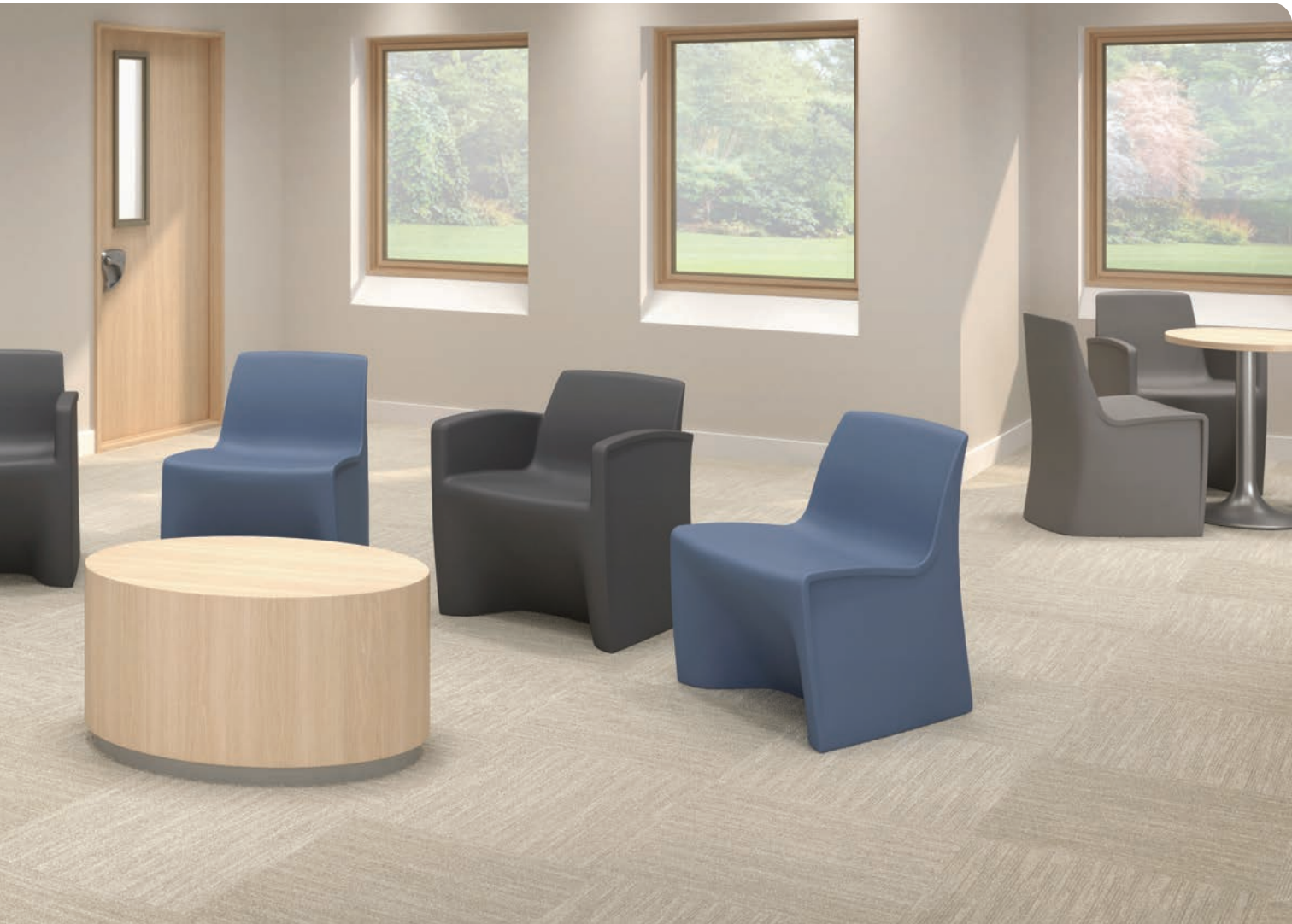
Hardi Lounge Armless Finish: RAL 5014. Hardi Lounge with Arms Finish: RAL 7015. Hardi Dining with Arms and Armless Finish: RAL 7037. Oval HD Finish: Wilsonart, 7850-60 Beigewood. Trumpet HD Finish: Wilsonart, 7850-60 Beigewood; Frame: Silver.