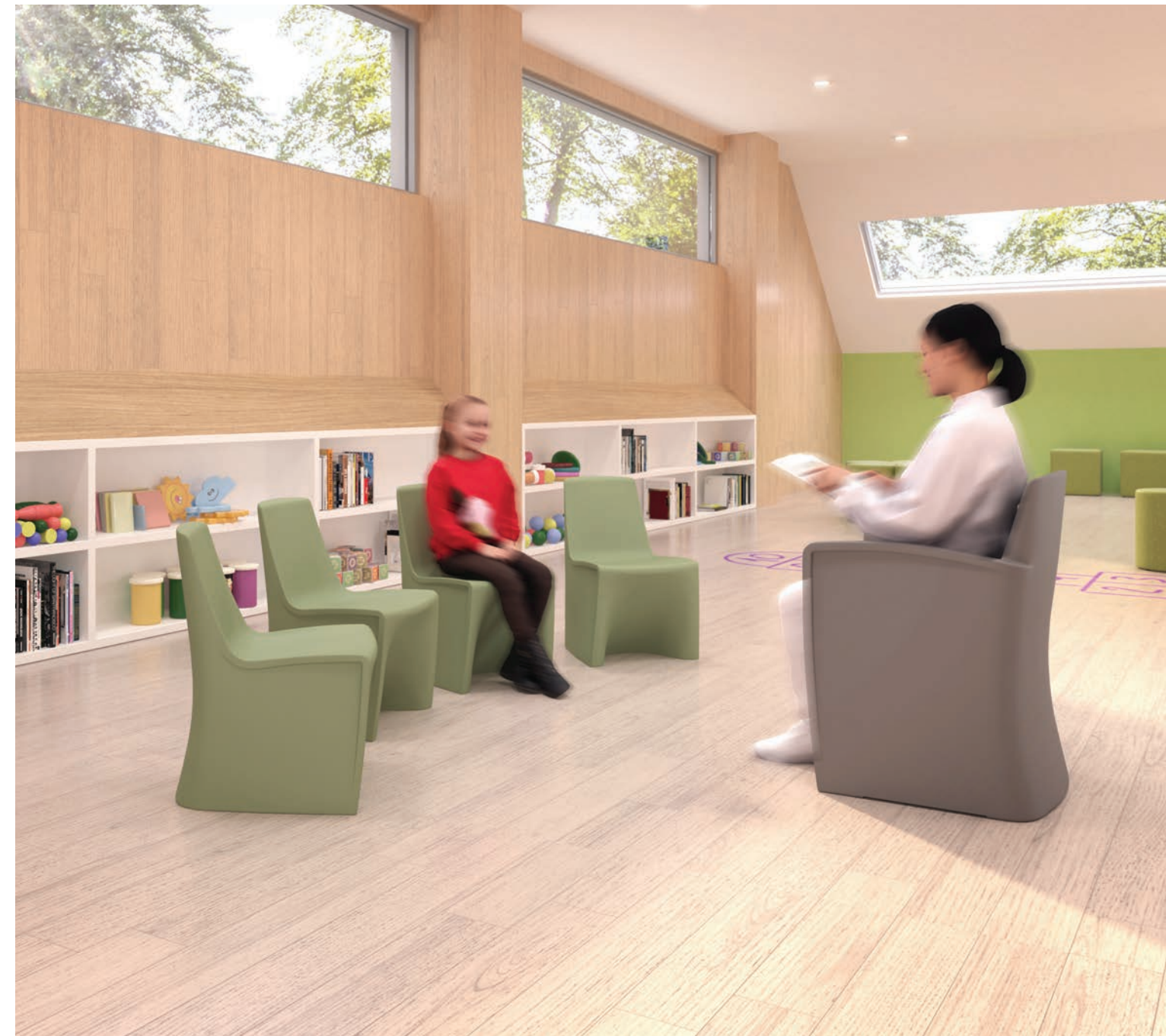
Hardi Children's Finish: RAL 6021.