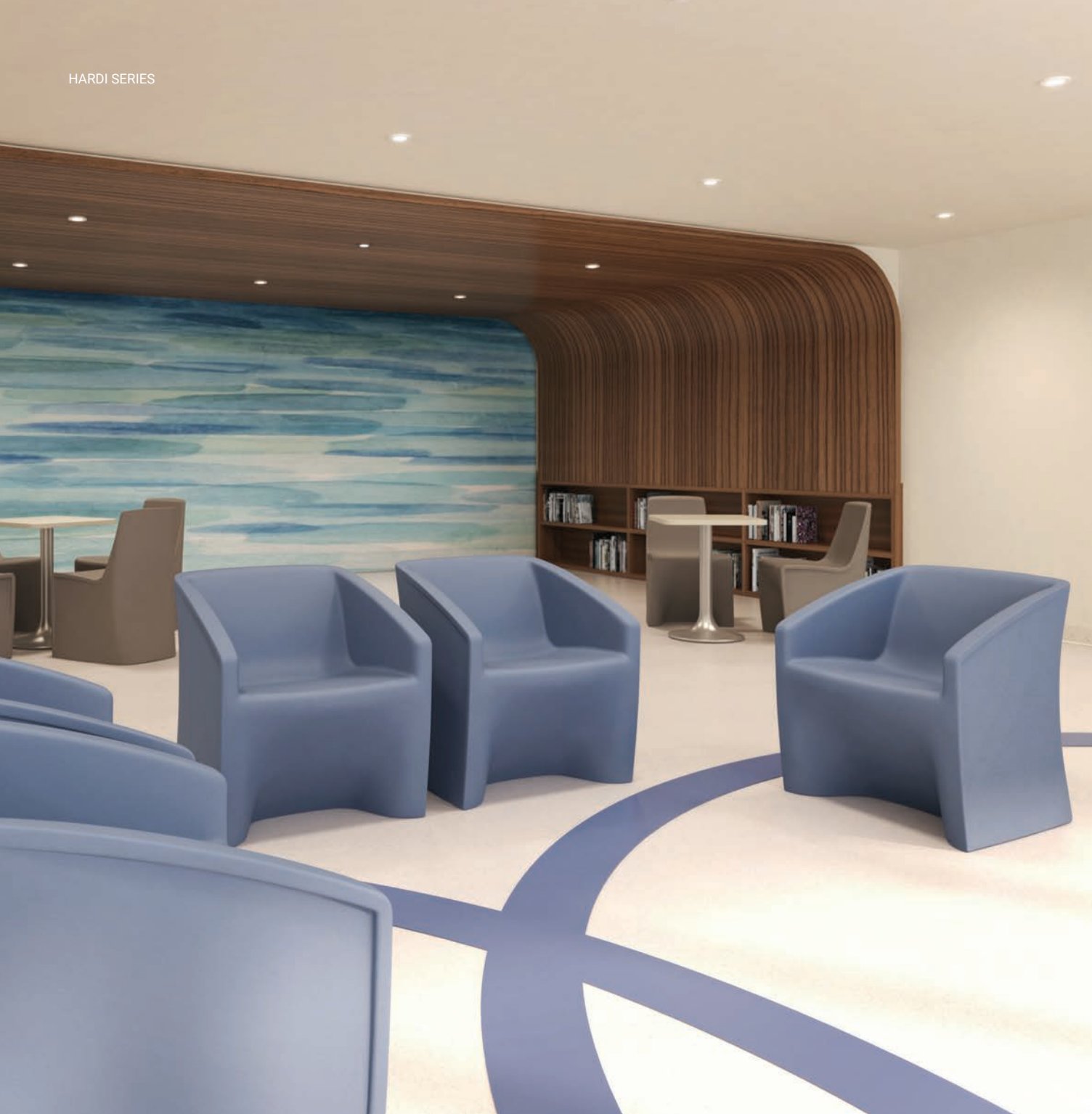
Hardi Dining Armless Finish: RAL 7037.