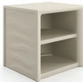
Hardi Bedside Table