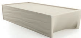
Hardi Patient Bed