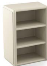
8906 Endurance Open Chest, Floor Mount