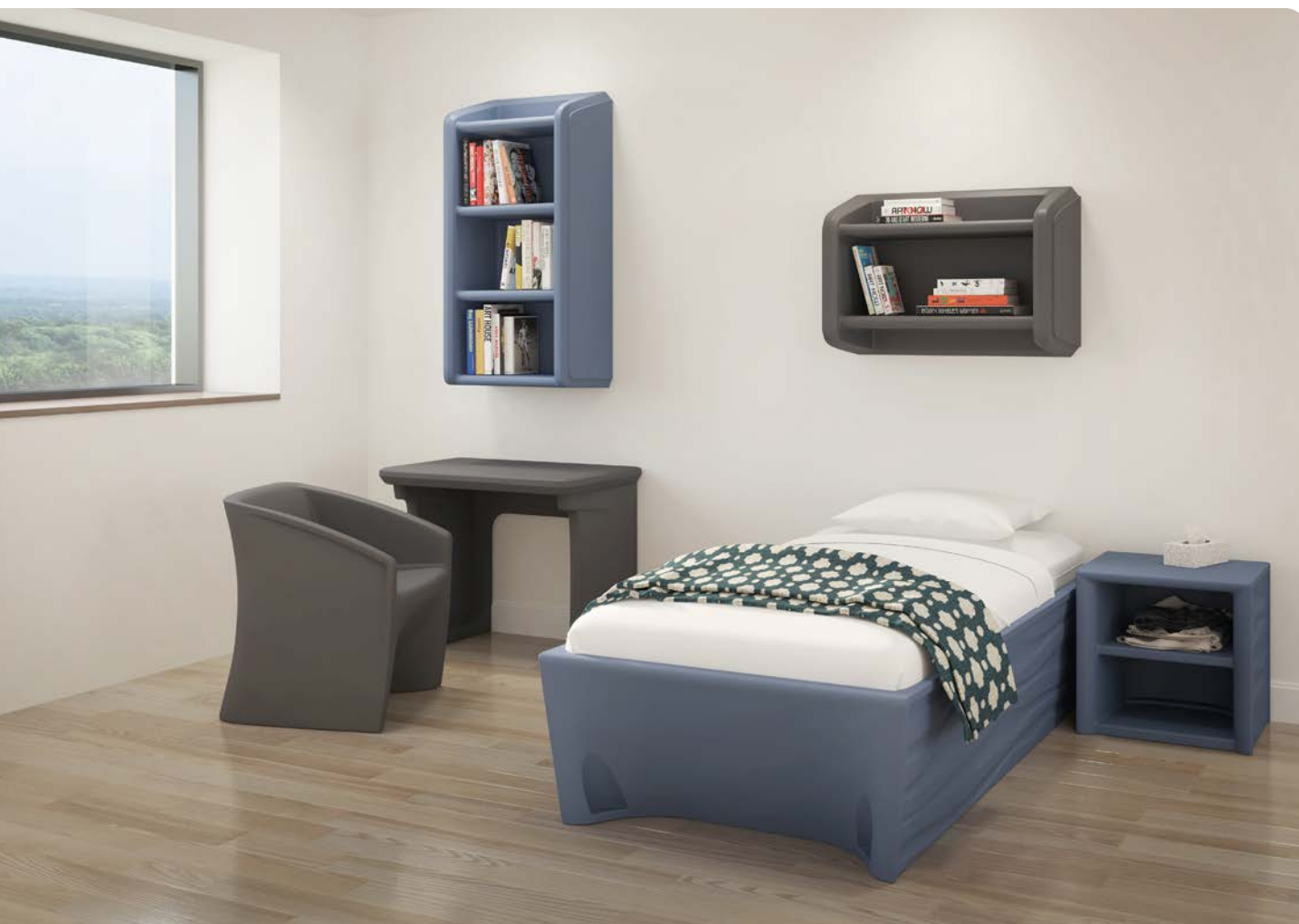
Hardi Bed, Bedside Table, Endurance 4-Shelf Wall Mount Unit Finish: RAL 5014.