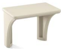
8853 Endurance Desk, Floor & Wall Mount