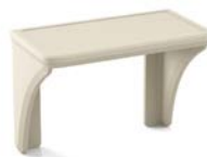
8854 Endurance ADA Desk, Wall Mount