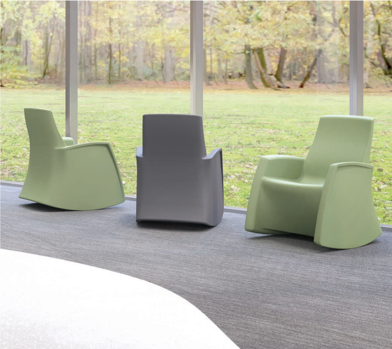
Hardi Rocker Finish: RAL 6021, Green; Finish: RAL 7015, Grey.