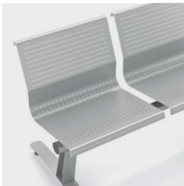
Seats can be specified in 76 standard finishes.