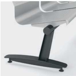
Seats, beams and legs can be specified in different Spectone colors.

76 Spectone colors from our line of powder epoxy coatings, including five textured finishes.