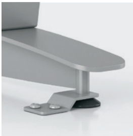
Choose the option of floor mounting straps.