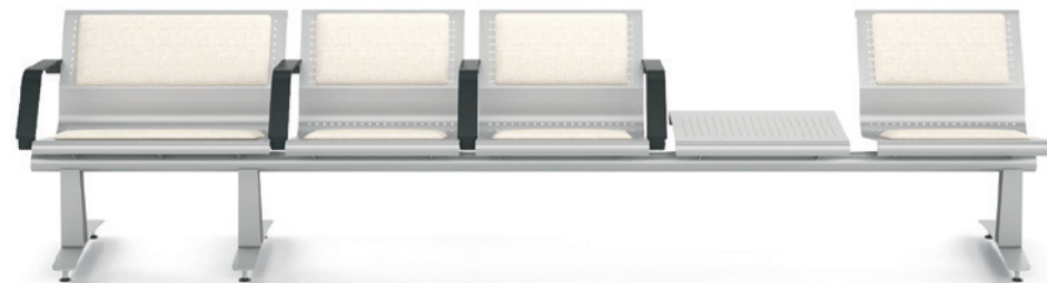
7010UG 7010U 7010U 70ST 7000U