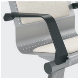
Polyurethane arms are available in black only.