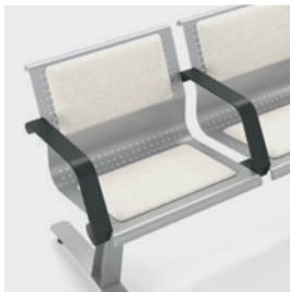
Upholstered cushions are field-replaceable.