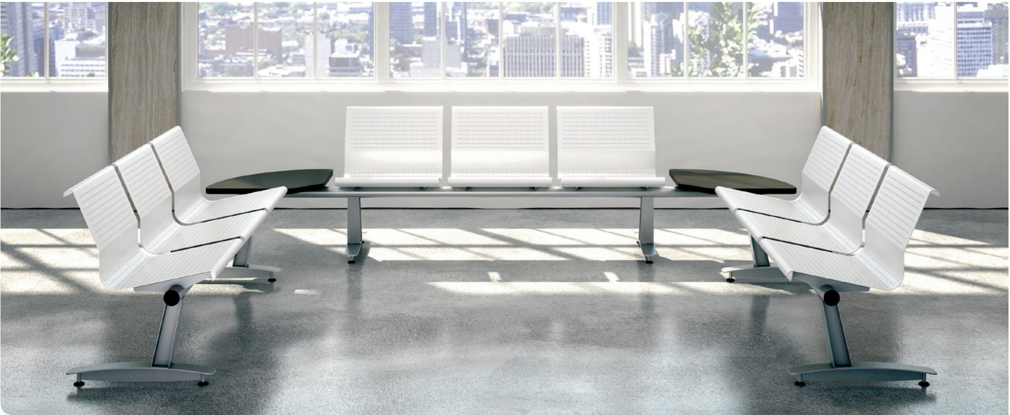
Traffic (Top) Upholstery: Momentum Silica, Regatta; Metal Finish: Silver. Traffic (Bottom) Seat Metal Finish: RAL 9016; Leg Metal Finish: Silver.