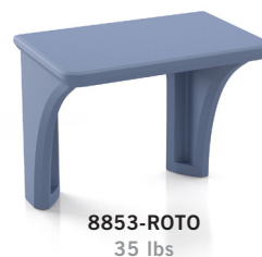
8853-ROTO 35 lbs