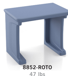
8852-ROTO 47 lbs