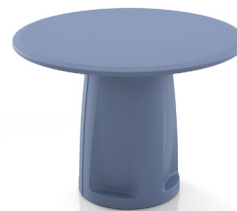
8850-42DIA-ROTO 38 lbs