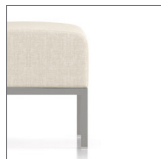
Non Wall-saving Frame

For fabrics you wish railroaded or repeats larger than 5" x 5", please contact the factory with repeat information, and yardage requirement will be provided.