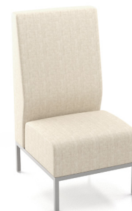
9101HB 54 lbs