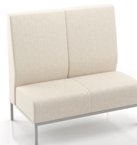
9102HB 98 lbs