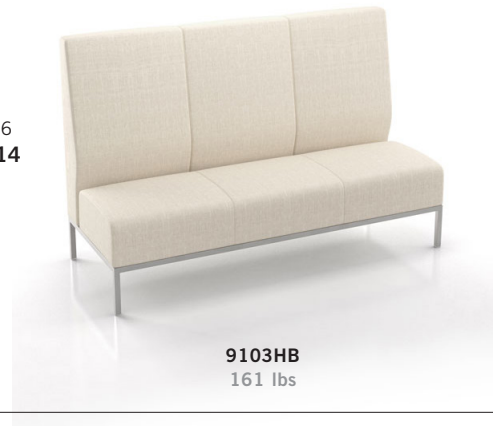
9103HB 161 lbs