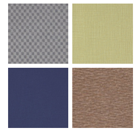
Select fabrics from one of our textile partners