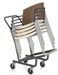
1899G/1899M Midsize/Bariatric 24 lbs