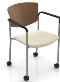
1902 With arms 19 lbs

Meets BIFMA Seating Durability Test to 500 lbs CAL 133, add $36 List 1" extra seat foam, specify and add $17 List