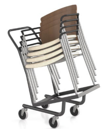
1899M Midsize 24 lbs