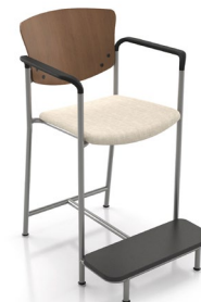
1921E With arms 30 lbs

Meets BIFMA Seating Durability Test to 500 lbs CAL 133, add $36 List 1" extra seat foam, specify and add $17 List