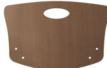
Wood Back Design "C"