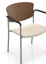
1904 With arms 20 lbs