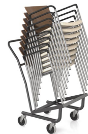
1899 Standard 18 lbs