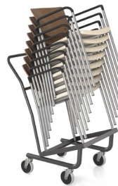
1899 Standard 18 lbs