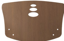
Wood Back Design "A"