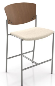
1926 Without arms 24 lbs