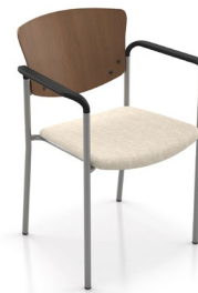
1901 With arms 18 lbs

Meets BIFMA Seating Durability Test to 500 lbs CAL 133, add $36 List 1" extra seat foam, specify and add $17 List