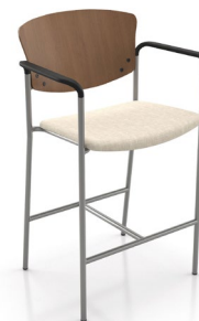
1924 With arms 25 lbs

Meets BIFMA Seating Durability Test to 500 lbs CAL 133, add $49 List 1" extra seat foam, specify and add $26 List