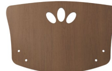
Wood Back Design "D"