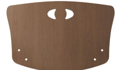
Wood Back Design "E"