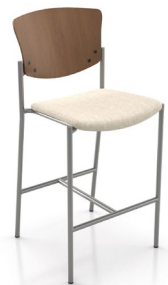
1951 Without arms 20 lbs