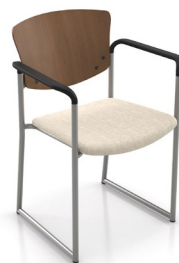
1931 With arms 21 lbs

Meets BIFMA Seating Durability Test to 500 lbs CAL 133, add $36 List 1" extra seat foam, specify and add $17 List