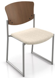
1941 Without arms 20 lbs