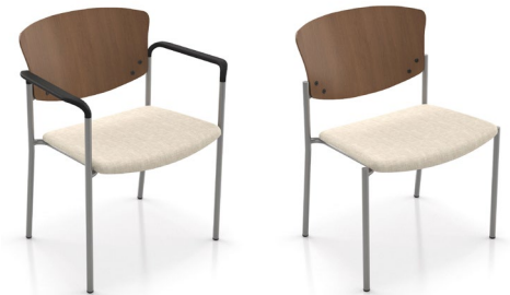
1904 With arms 20 lbs

Meets BIFMA Seating Durability Test to 500 lbs CAL 133, add $49 List 1" extra seat foam, specify and add $26 List