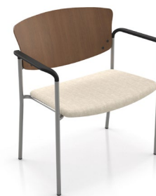
1903 With arms 25 lbs

Meets BIFMA Seating Durability Test to 500 lbs CAL 133, add $49 List 1" extra seat foam, specify and add $36 List