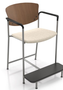
1924E With arms 32 lbs

Meets BIFMA Seating Durability Test to 500 lbs CAL 133, add $49 List 1" extra seat foam, specify and add $26 List