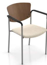
1901 With arms 18 lbs