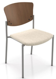
1911 Without arms 17 lbs