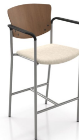
1921 With arms 21 lbs

Meets BIFMA Seating Durability Test to 500 lbs CAL 133, add $36 List 1" extra seat foam, specify and add $17 List