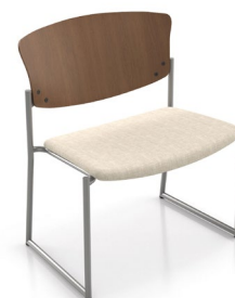
1943 Without arms 26 lbs

Meets BIFMA Seating Durability Test to 500 lbs CAL 133, add $49 List 1" extra seat foam, specify and add $36 List