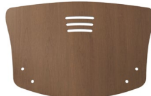
Wood Back Design "B"