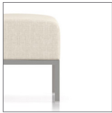
Non Wall-saving Frame

For fabrics you wish railroaded or repeats larger than 5" x 5", please contact the factory. Yardage requirement will be provided.