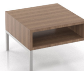
91ERO - 24 x 24 31 lbs