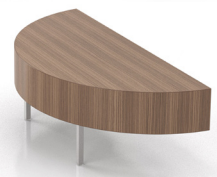
91HM 75 lbs