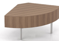
91RC 45 lbs