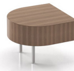
91ERB 36 lbs