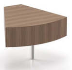
91RC45 32 lbs