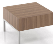
91ERC - 24 x 24 33 lbs