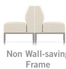
Non Wall-saving Frame

To ensure proper configuration please provide a layout drawing.