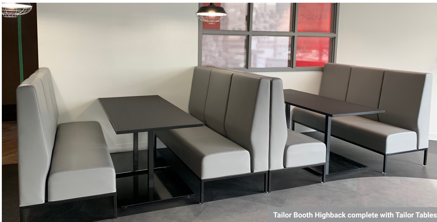
Tailor Booth Highback complete with Tailor Tables

Tailor Booth can be seen throughout the common areas, creating a comfortable place for coworkers to gather, grab a bite, or work. Staying true to the composition of the room, a neutral look of the Tailor Booth is paired with an all-black Tailor Tables.