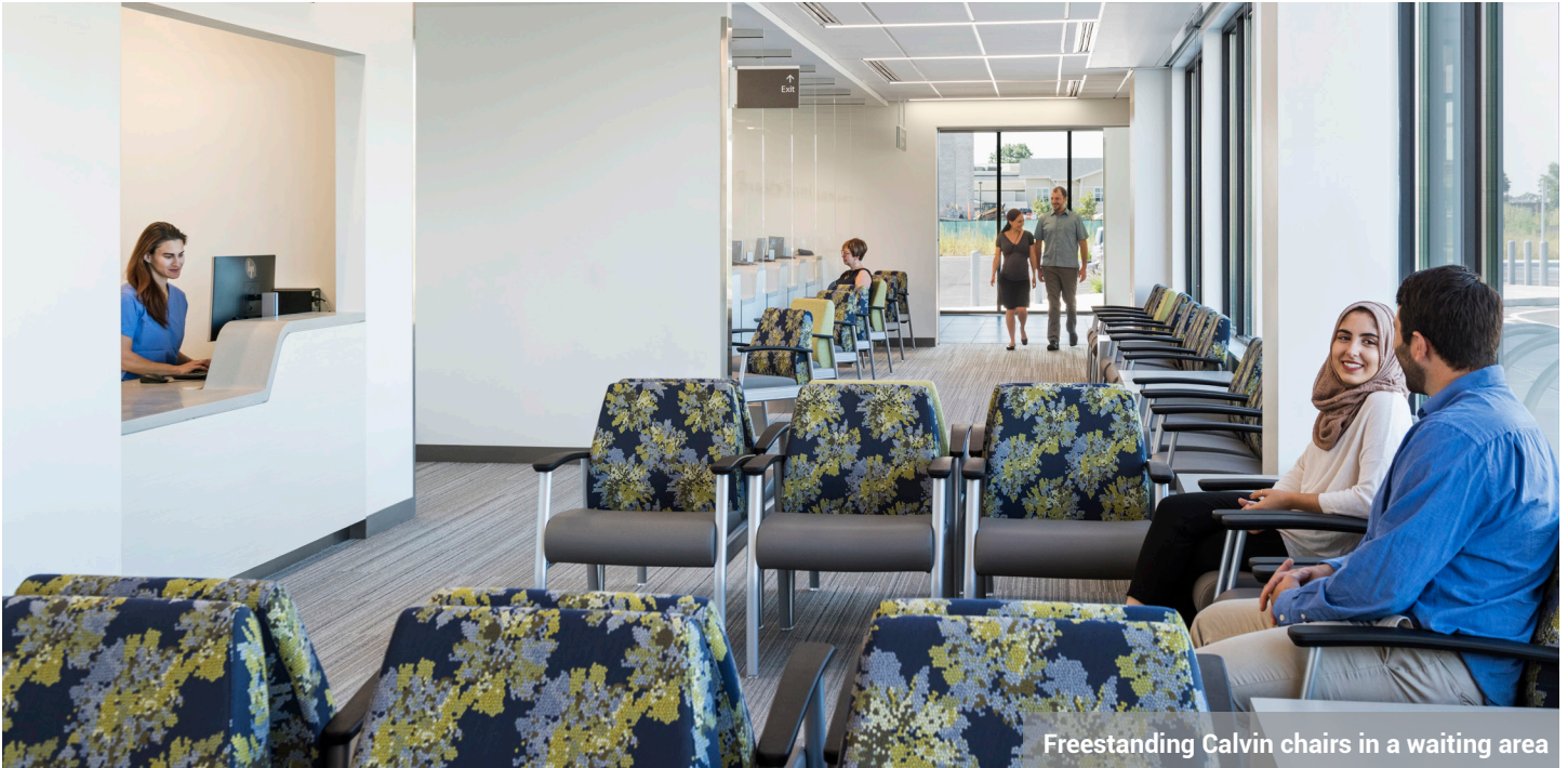
Freestanding Calvin chairs in a waiting area

requirements, the product needed to be pleasing to an eye; it must be designed for the healthcare environment and is capable of keeping up with high patient throughput. Durable healthcare grade fabrics were selected in solids and prints, and in various colors to soften up the overall feel of the space.