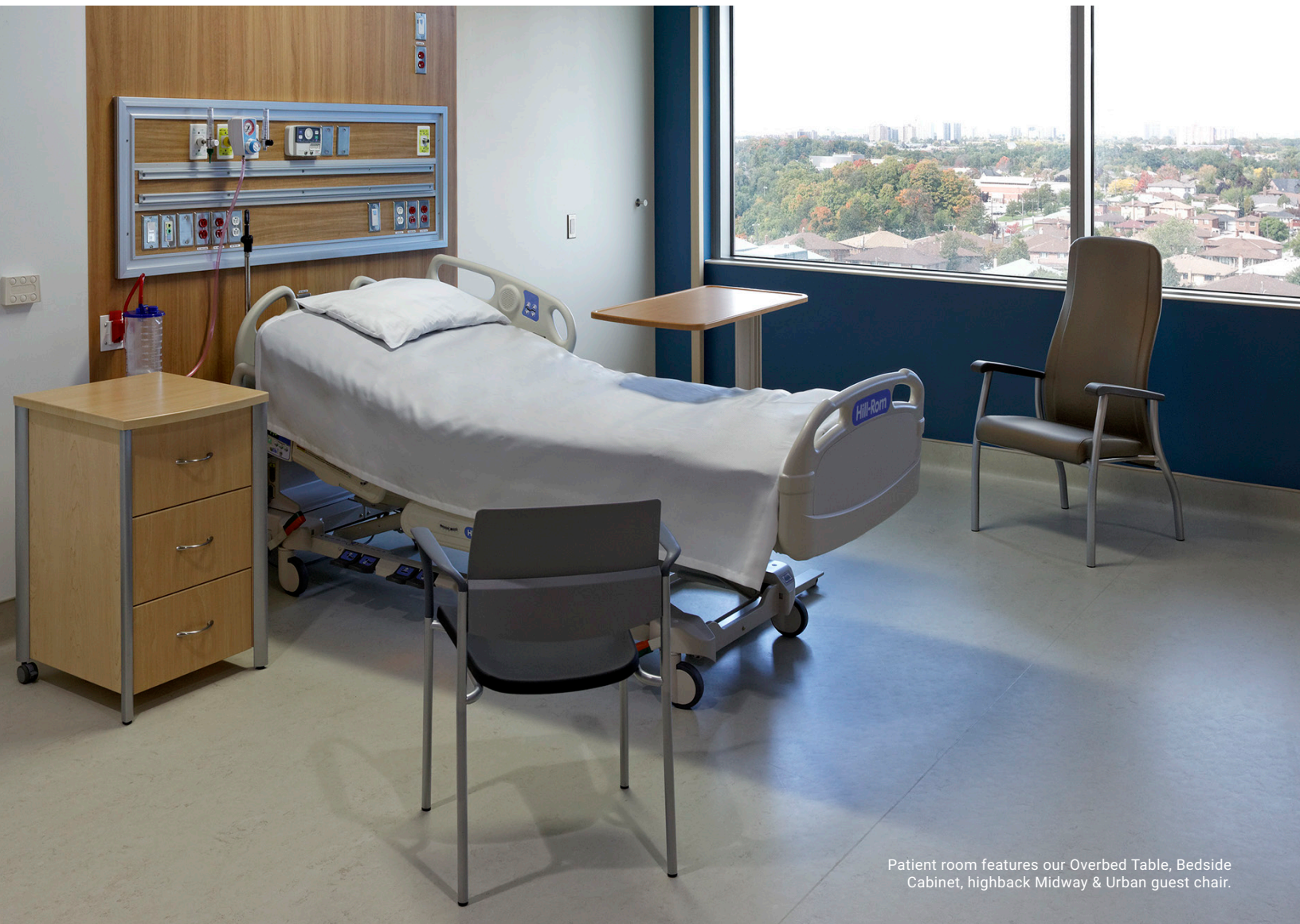
Patient room features our Overbed Table, Bedside Cabinet, highback Midway & Urban guest chair.

One of Canada's largest regional acute care hospitals, the care centre recently opened its doors after having undergone a massive redevelopment program. The brand new hospital, which combined three separate care centers, put technology at the forefront of their modernization efforts and has become North America's first fully digital hospital.