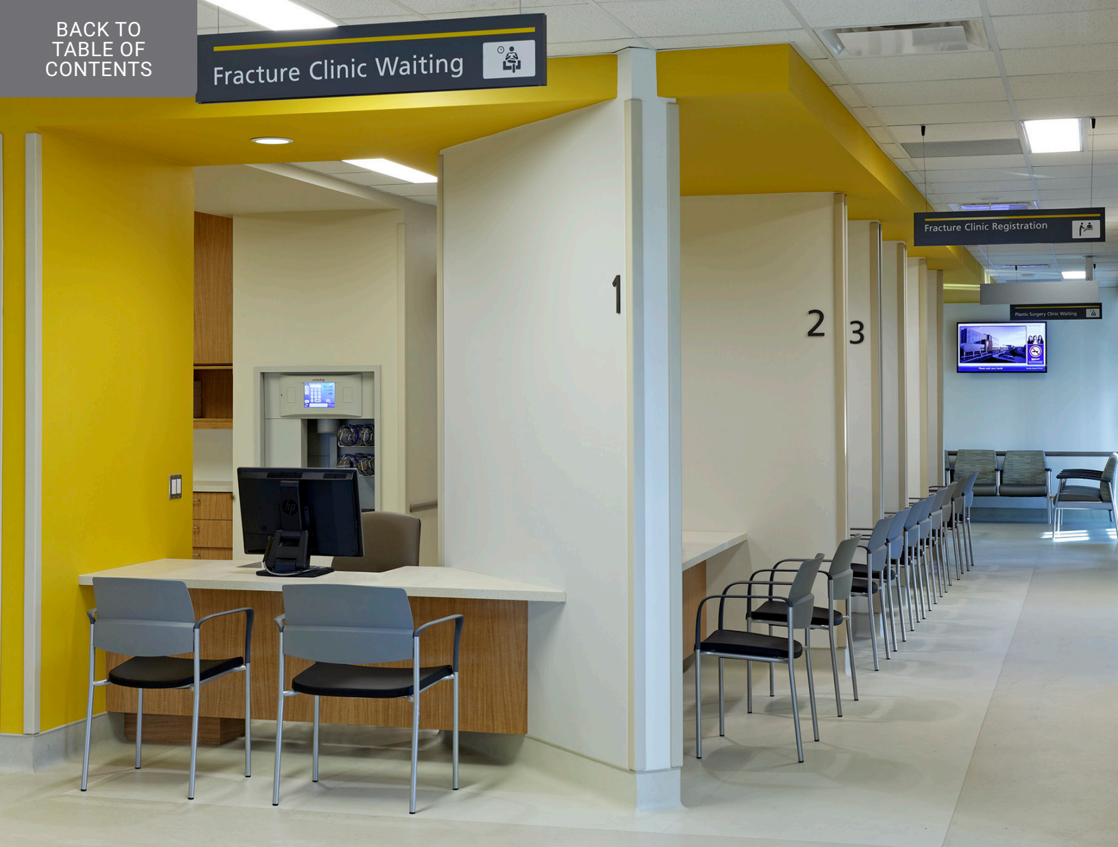
Top: The Fracture Clinic Waiting Room features a combination of standard & Midsize Urban with plastic back and DuraSpec seat. Bottom: Consultation Rooms outfitted with our standard & midsize Award Winning Urban.