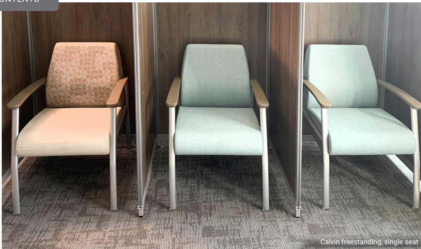
Calvin freestanding, single seat

A fluid design approach was taken using laminate and glass panels to add division between visitors while still allowing for easy reconfiguration as needed.