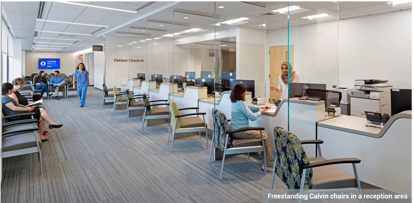
Freestanding Calvin chairs in a reception area