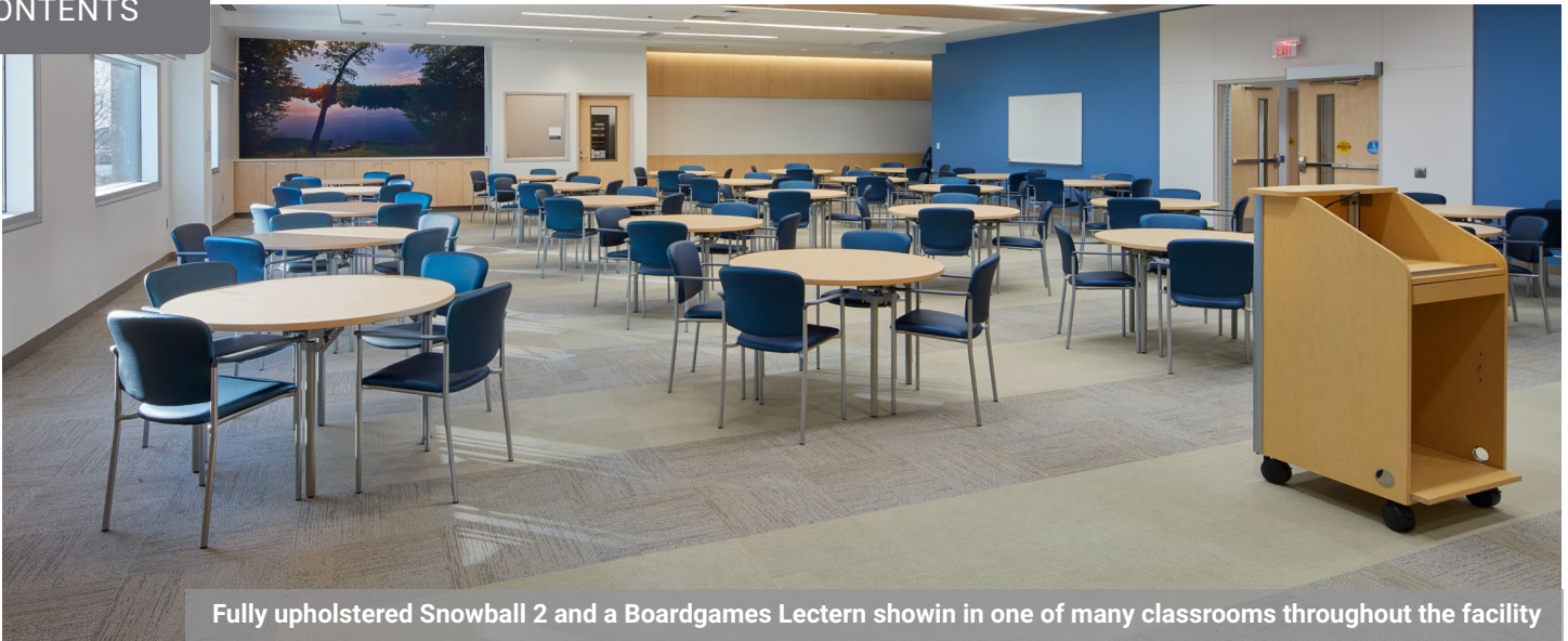
Fully upholstered Snowball 2 and a Boardgames Lectern shown in one of many classrooms throughout the facility

rooms that are available for the community use - a variety of Snowball models of various layouts and Spec's lecterns can be found. Snowball 3, with a solid maple wood back, is featured in meditation and worship rooms within the facility.