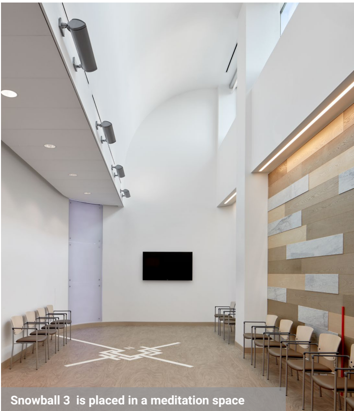
Snowball 3 is placed in a meditation space

With an abundance of nature and nature-like views, gentle colors, and a variety of light sources, this hospital is a welcoming place for patients, visitors, and caregivers.