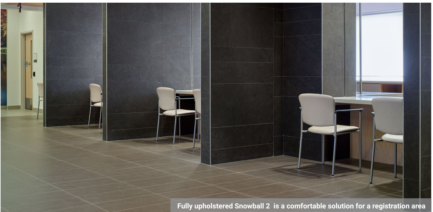
Fully upholstered Snowball 2 is a comfortable solution for a registration area

With a hospital of such a large scale, there is an opportunity to outfit multiple room types with a variety of seating solutions. Selected for its universal look, comfort, and durability, over one thousand Snowball chairs were purchased for this project. Starting with registration areas and continuing on to classrooms, meeting rooms, and training