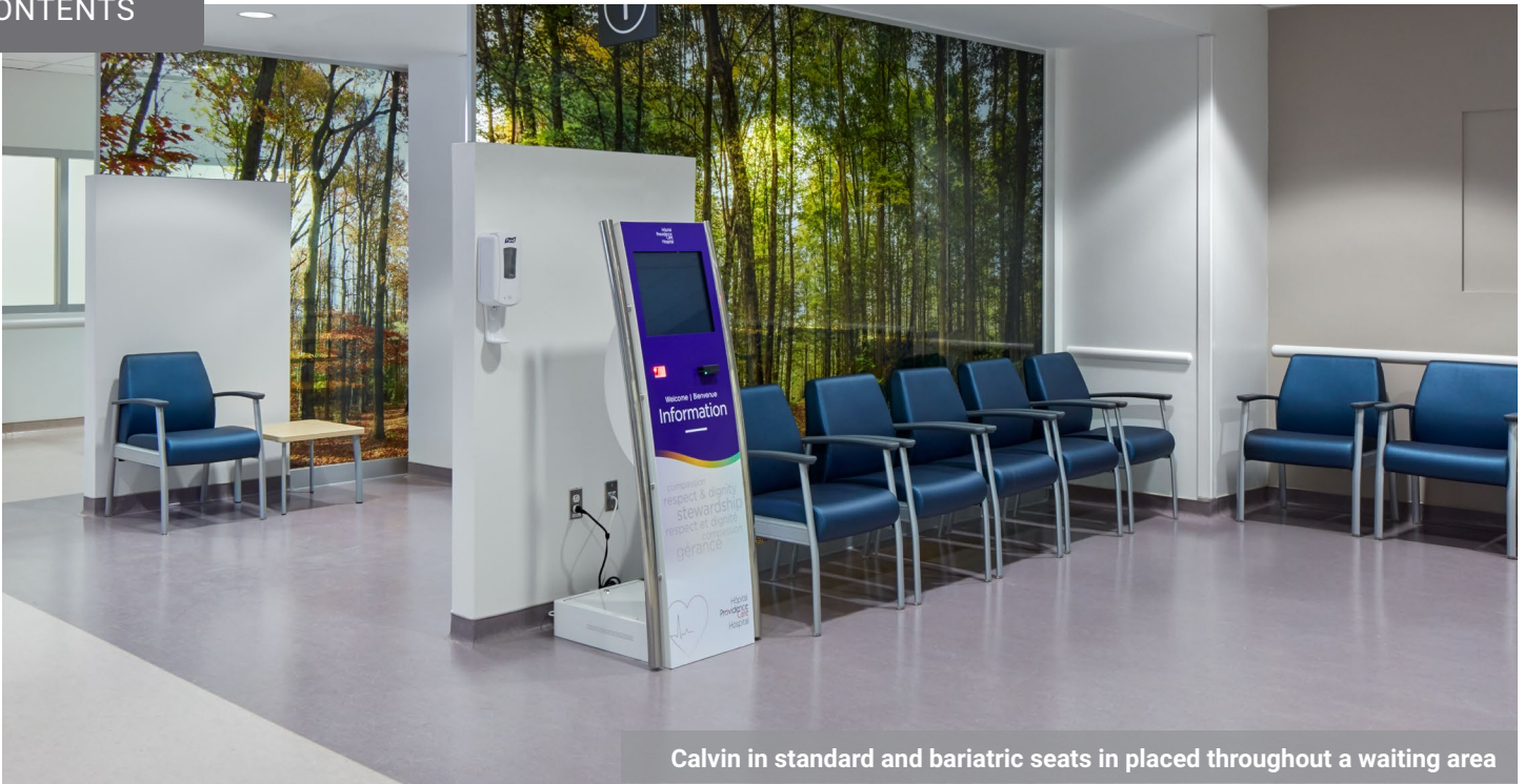
Calvin in standard and bariatric seats in placed throughout a waiting area

The proximity of the lake inspired the use of blue tones inside the facility. A variety of fabrics specified for Calvin chairs blend nicely with the tranquil aesthetic set throughout the waiting areas. A mix of standard and bariatric seats, along with Calvin occasional tables, complete the functional and aesthetic needs of these spaces.