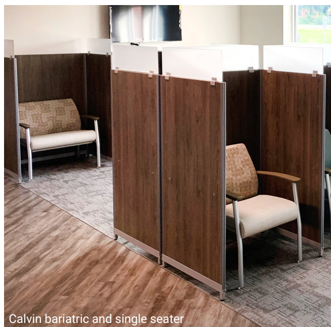
Calvin bariatric and single seater