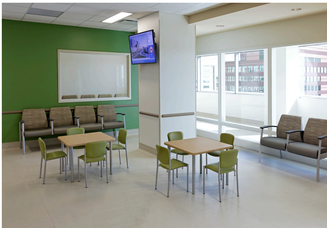
Top: Public waiting room features connected Calvin Bottom: Children's Snowflake chairs and tables & connected Calvin complement the colorful decor of the hospital