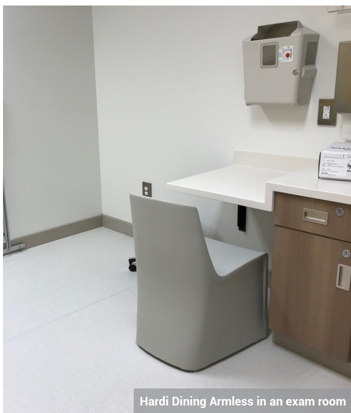
Hardy Dining Armless in an exam room

With an industry shift away from institutional looking furniture to designs that provide peace of mind for both patient and caregiver, Spec's award-winning Hardy Series is prominently featured throughout this cutting-edge treatment facility.