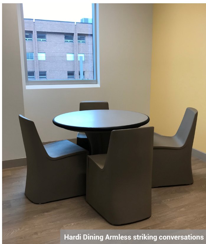
Hardy Dining Armless striking conversations