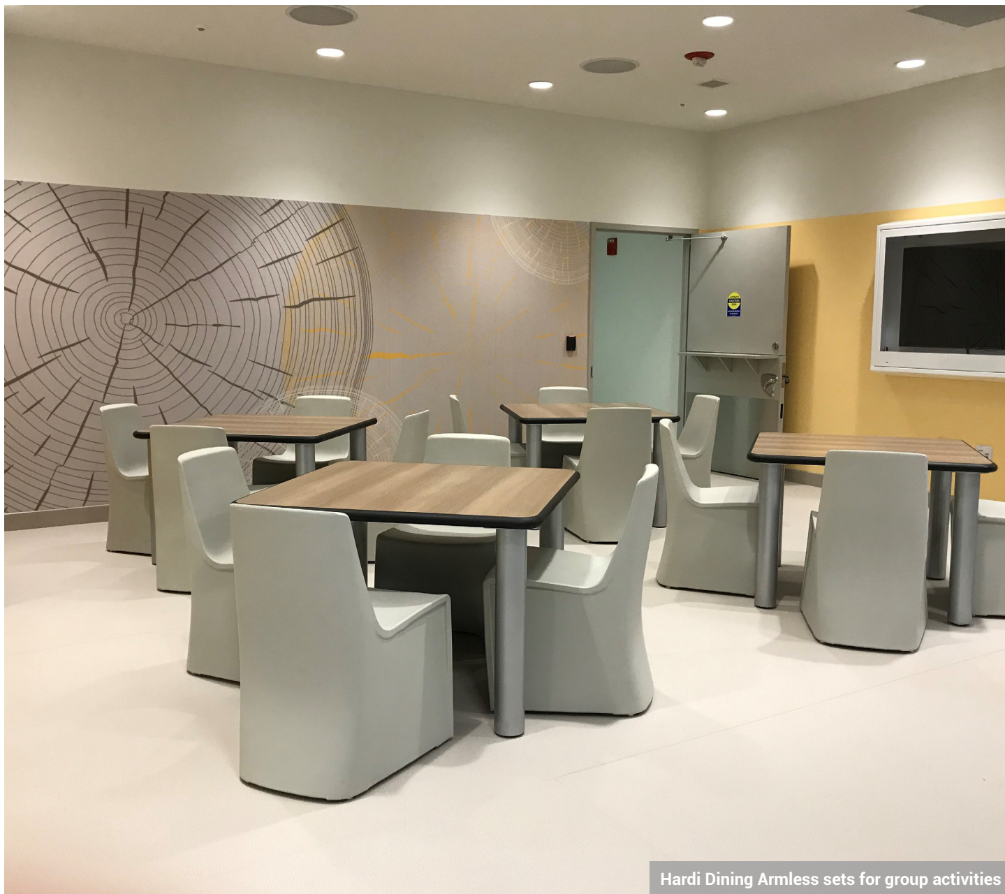
Hardi Dining Armless sets for group activities

With five additional designs in the collection (not shown here), the Hardi Series is versatile enough to be placed into the most clinical of settings to rooms with calming nature-inspired motifs; in both group or supervised spaces for soothing or self-reflection.