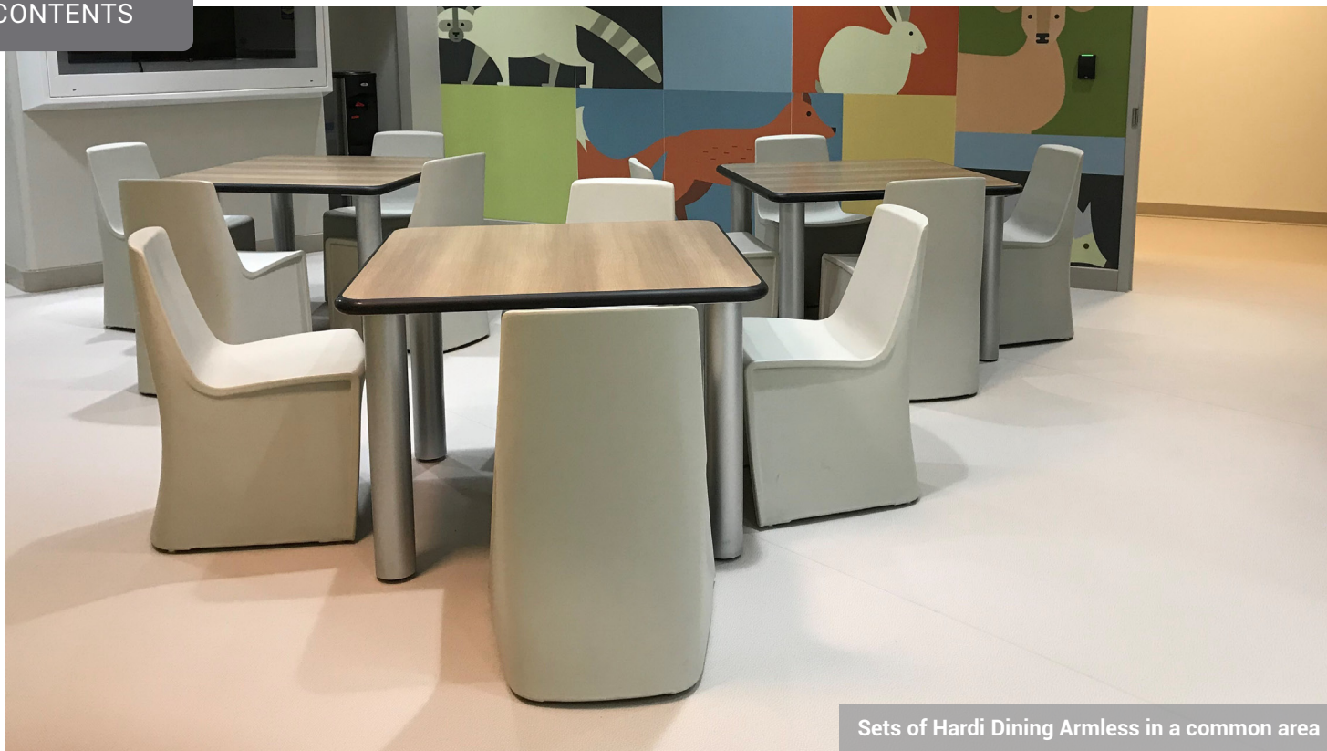
Sets of Hardy Dining Armless in a common area

With over 200,000 square feet of floor space, the hospital is fitted with exam rooms, lounge areas, patient rooms, relaxation spaces, classrooms, and even a hair salon - placing patient care, comfort and safety are at the forefront of the design.