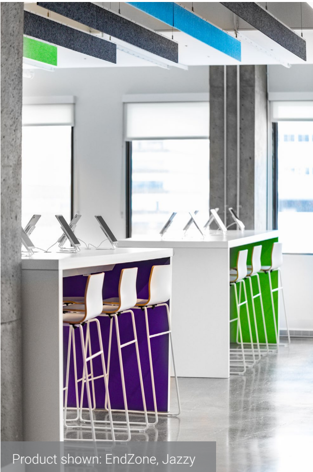
Product shown: EndZone, Jazzy

As employees transition back to the office, designers are focusing on building spaces that foster relationship-building and cafeteria spaces are no exception. This large, open-plan cafeteria achieves just that through varied dining heights, tech-ready spaces, ample seats, and abundant natural light.