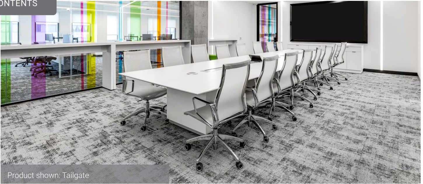
Product shown: Tailgate

The design directive on this project heavily relied on using color to both accentuate and segment areas and create a stylish and comfortable employee-centric workplace. With an abundance of standard finishes and furniture designs to meet the customer's colorful vision, Spec was at the top of the suppliers' list for the project.