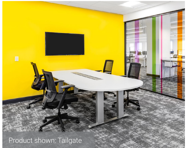
Product shown: Tailgate