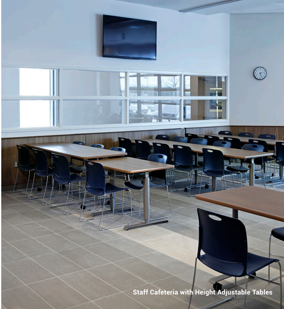
Staff Cafeteria with Height Adjustable Tables