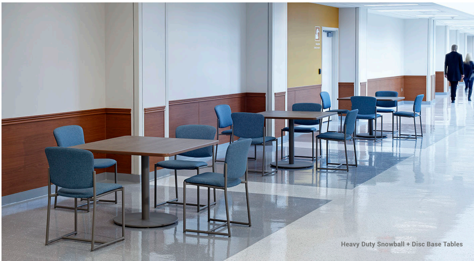
Heavy Duty Snowball + Disc Base Tables