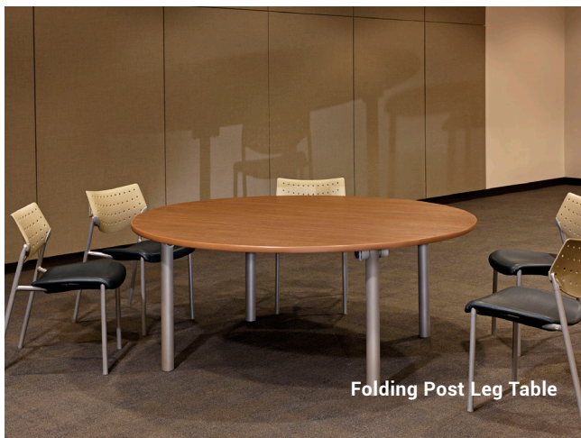
Folding Post Leg Table