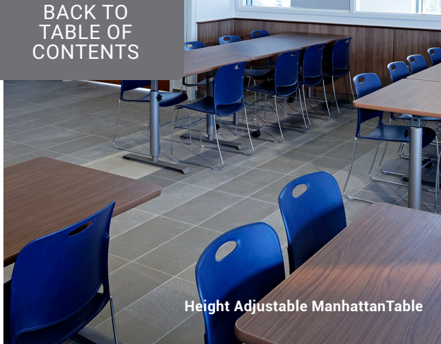
Height Adjustable ManhattanTable