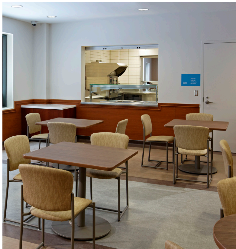
Patient Cafeteria with HD Snowball and Disc Base Tables

The hospital mainly specified Spec for supervised and semi-supervised areas. In order to ensure patient and staff safety, these areas were furnished with weighted, tamper-proof designs like our award winning Dignity chair, heavy duty Snowball 2 and weighted disc base tables. Additionally, Waypoint often hosts seminars and training for industry professionals at their facility – Manhattan flip top tables with power options and height adjustable cafeteria tables were specified to provide accessible and efficient learning environments for staff and behavioral health experts.