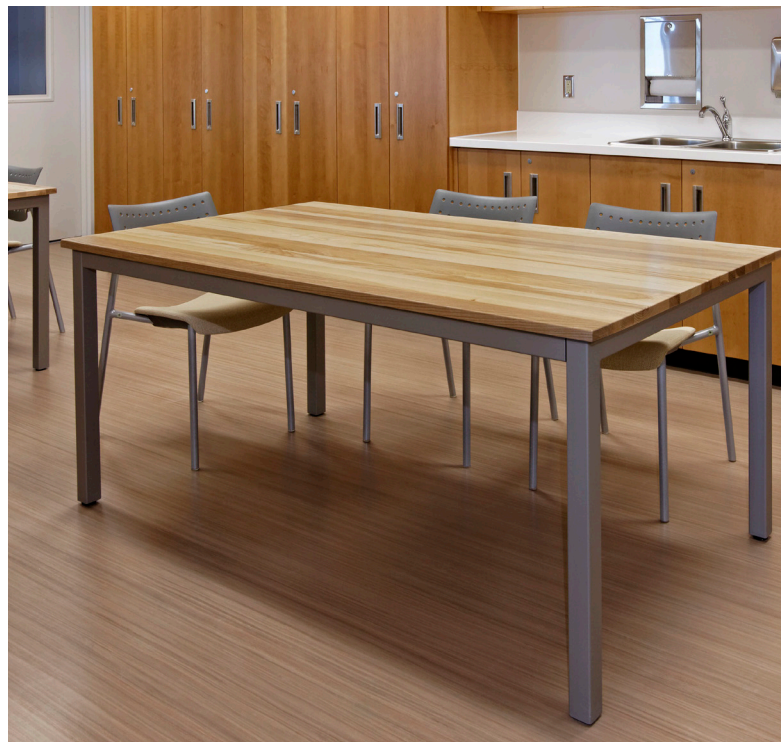
Activity Room Featuring Custom Post Leg Table