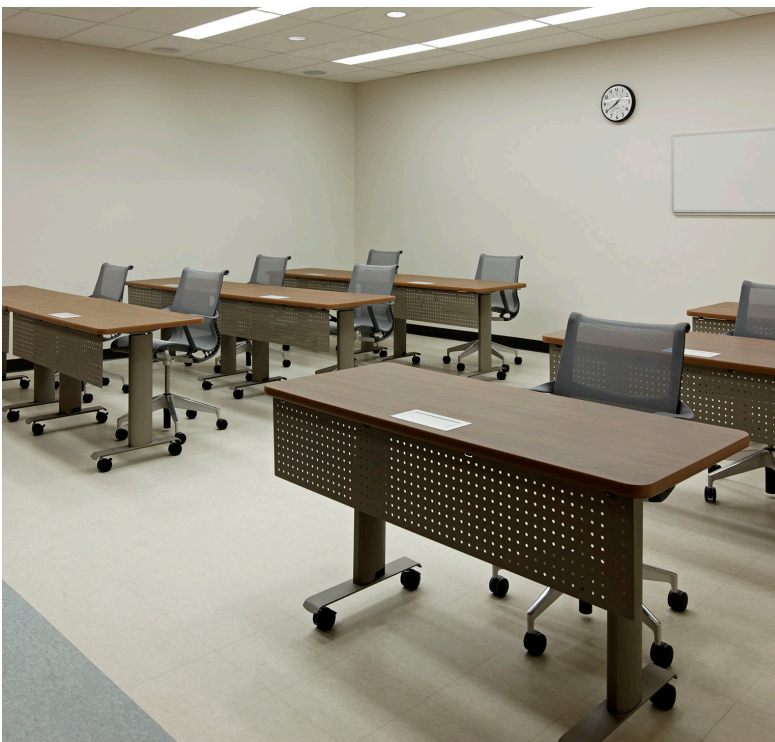
Training Room with Manhattan T-Base Tables on Casters

The hospital mainly specified Spec for supervised and semi-supervised areas. In order to ensure patient and staff safety, these areas were furnished with weighted, tamper-proof designs like our award winning Dignity chair, heavy duty Snowball 2 and weighted disc base tables. Additionally, Waypoint often hosts seminars and training for industry professionals at their facility – Manhattan flip top tables with power options and height adjustable cafeteria tables were specified to provide accessible and efficient learning environments for staff and behavioral health experts.