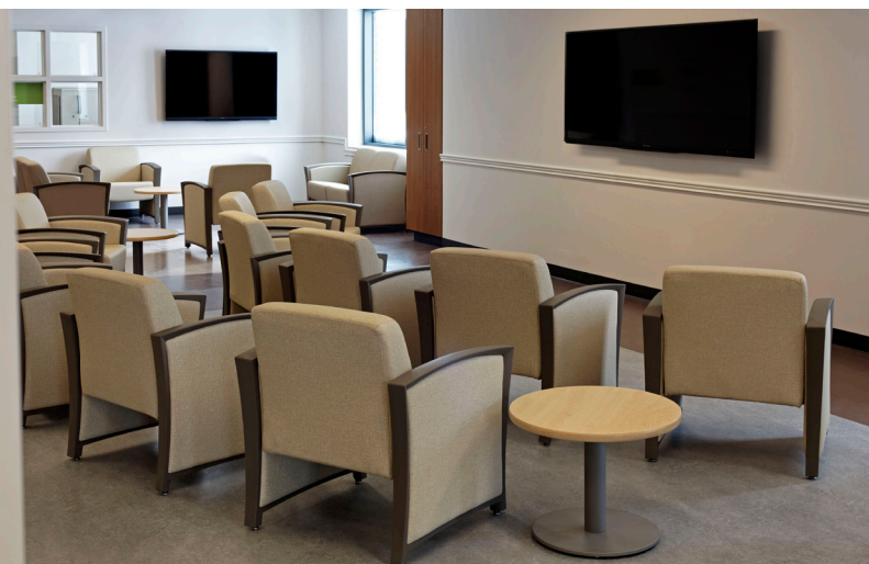
Theatre Room with Freestanding Dignity

With it's breathtaking views of Georgian Bay, the goal of the new Waypoint building was to emphasize patient healing in a safe and inclusive environment. A great deal of research and development went into the establishment in order to create a welcoming space for patients, with focus on creating an environment in which staff and patients can work and live cohesively.