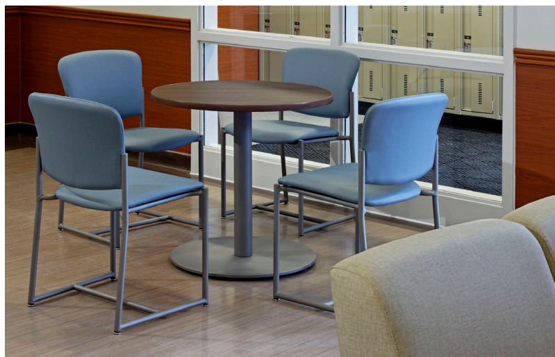
Lounge Area Featuring HD Snowball + HD Disc Base Table