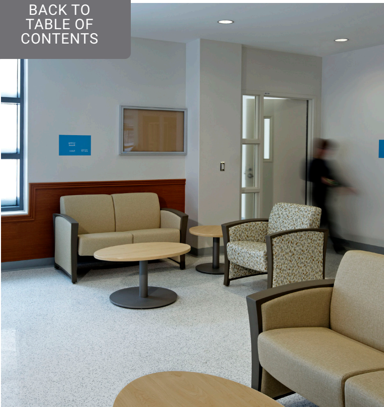
Lounge Area with Single and Two-Seater Dignity