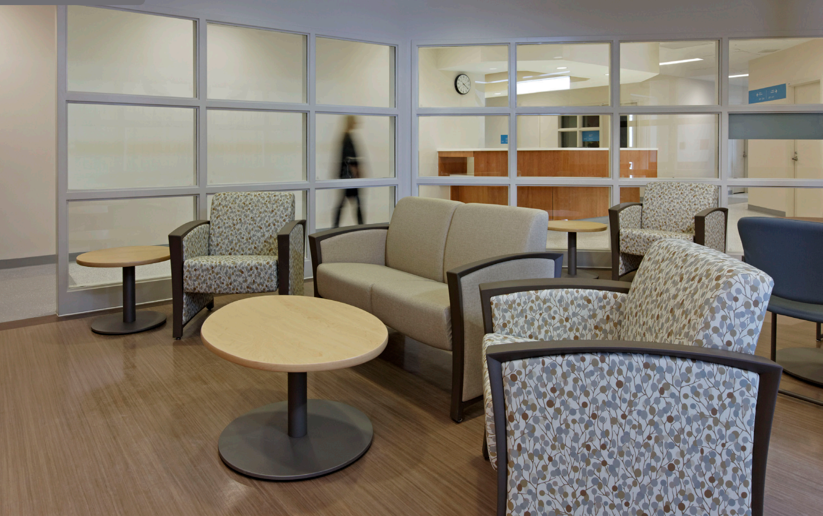
Lounge Area Featuring Dignity + Disc Base Occasional Tables

With it's breathtaking views of Georgian Bay, the goal of the new Waypoint building was to emphasize patient healing in a safe and inclusive environment. A great deal of research and development went into the establishment in order to create a welcoming space for patients, with focus on creating an environment in which staff and patients can work and live cohesively.