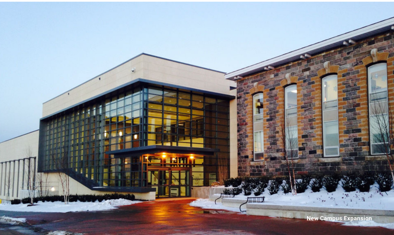
New Campus Expansion

Waypoint Centre for Mental Health Care has been at the forefront of behavioral health rehabilitation in Canada since its inception in 1904. Employing over 1200 employees and 80 dedicated volunteers, the hospital currently has over 300 beds. In an effort to adapt to new therapies and treatment philosophies, Waypoint acts as a resource within the community by operating outpatient, rehabilitation and housing programs in the neighboring areas.