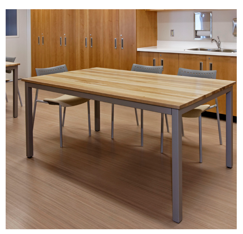
Activity Room Featuring Custom Post Leg Table