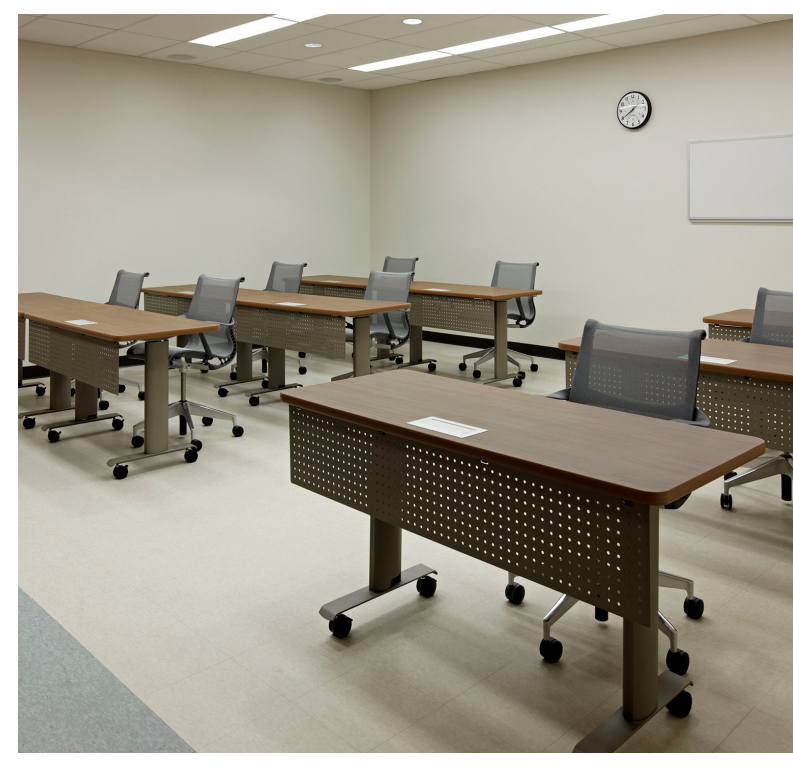
Training Room with Manhattan T-Base Tables on Casters

The hospital mainly specified Spec for supervised and semi-supervised areas. In order to ensure patient and staff safety, these areas were furnished with weighted, tamper-proof designs like our award winning Dignity chair, heavy duty Snowball 2 and weighted disc base tables. Additionally, Waypoint often hosts seminars and training for industry professionals at their facility – Manhattan flip top tables with power options and height adjustable cafeteria tables were specified to provide accessible and efficient learning environments for staff and behavioral health experts.