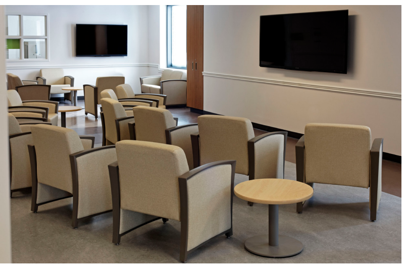
Theatre Room with Freestanding Dignity

With it's breathtaking views of Georgian Bay, the goal of the new Waypoint building was to emphasize patient healing in a safe and inclusive environment. A great deal of research and development went into the establishment in order to create a welcoming space for patients, with focus on creating an environment in which staff and patients can work and live cohesively.