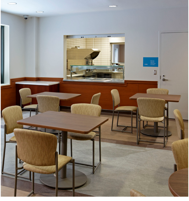
Lounge Area with Single and Two-Seater Dignity