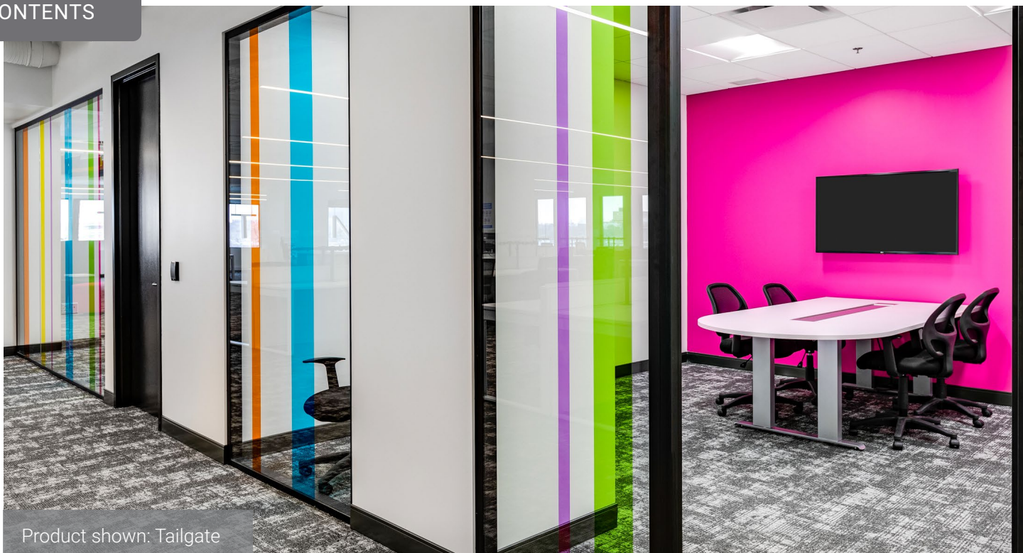
Product shown: Tailgate

Tailgate was selected for other meeting spaces as well. With a double-column Manhattan base, this collaborative table's robust power trough and wire management offer easy connectivity for video conference calls. The bullet-shaped top provides all meeting participants with a view of the monitor. Again, color makes a substantial impact in this office space, with bold paint applied to the walls in each room.