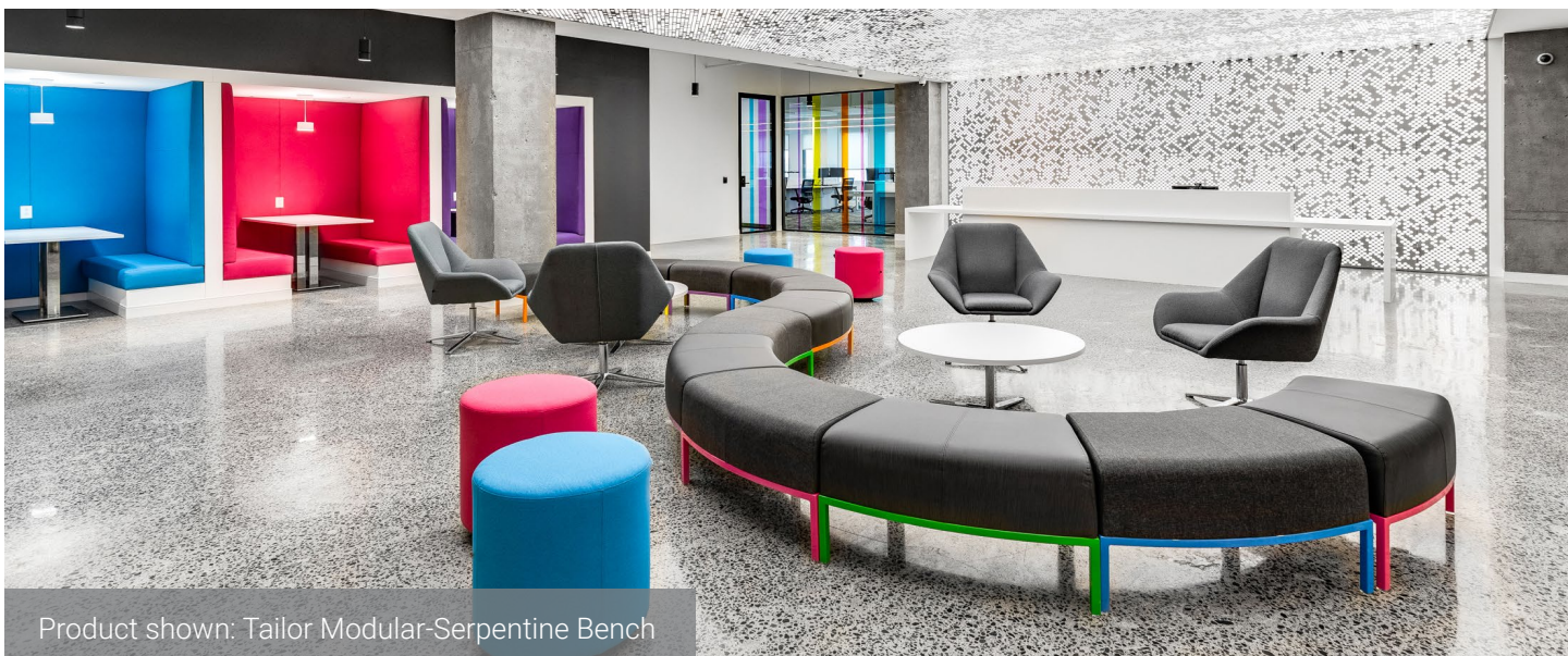
Product shown: Tailor Modular-Serpentine Bench

The new open-plan lounge offers plenty of room to disconnect and reconnect with coworkers and clients or catch up on work. The soft curves of Tailor Bench are used to create inspiring ancillary seating that has a residential feel with its upholstered seats. Chosen from 76 standard Spectone metal colors, bright blue, orange, green, and pink are featured on the bench frames to continue with the color design element used throughout the office.