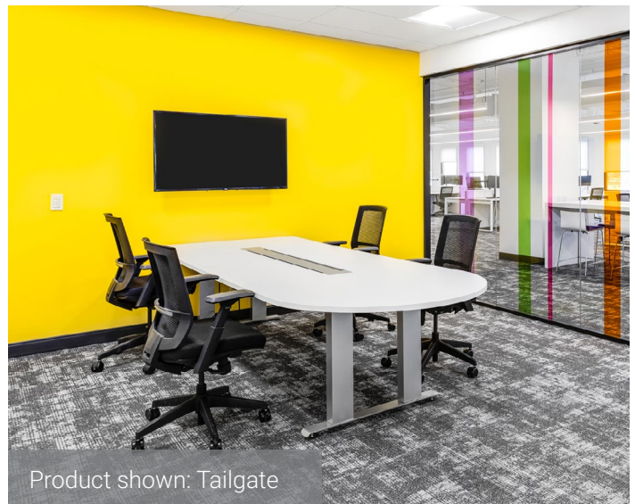
Product shown: Tailgate