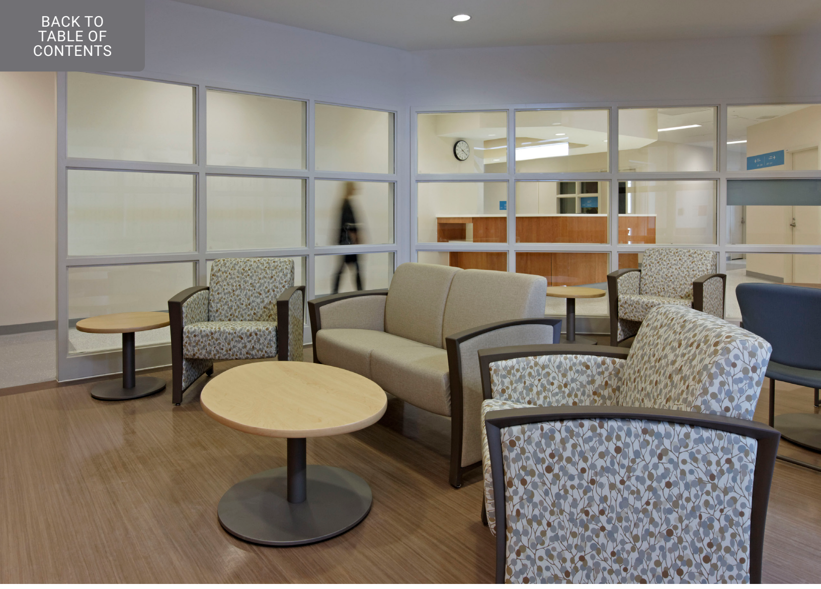
Lounge Area Featuring Dignity + Disc Base Occasional Tables

With it's breathtaking views of Georgian Bay, the goal of the new Waypoint building was to emphasize patient healing in a safe and inclusive environment. A great deal of research and development went into the establishment in order to create a welcoming space for patients, with focus on creating an environment in which staff and patients can work and live cohesively.