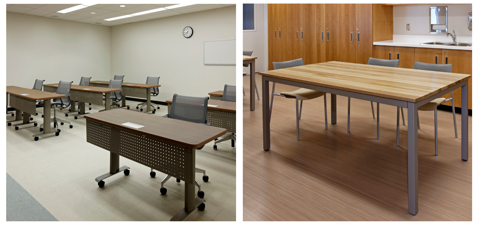
Training Room with Manhattan T-Base Tables on Casters

The hospital mainly specified Spec for supervised and semi-supervised areas. In order to ensure patient and staff safety, these areas were furnished with weighted, tamper-proof designs like our award winning Dignity chair, heavy duty Snowball 2 and weighted disc base tables. Additionally, Waypoint often hosts seminars and training for industry professionals at their facility – Manhattan flip top tables with power options and height adjustable cafeteria tables were specified to provide accessible and efficient learning environments for staff and behavioral health experts.