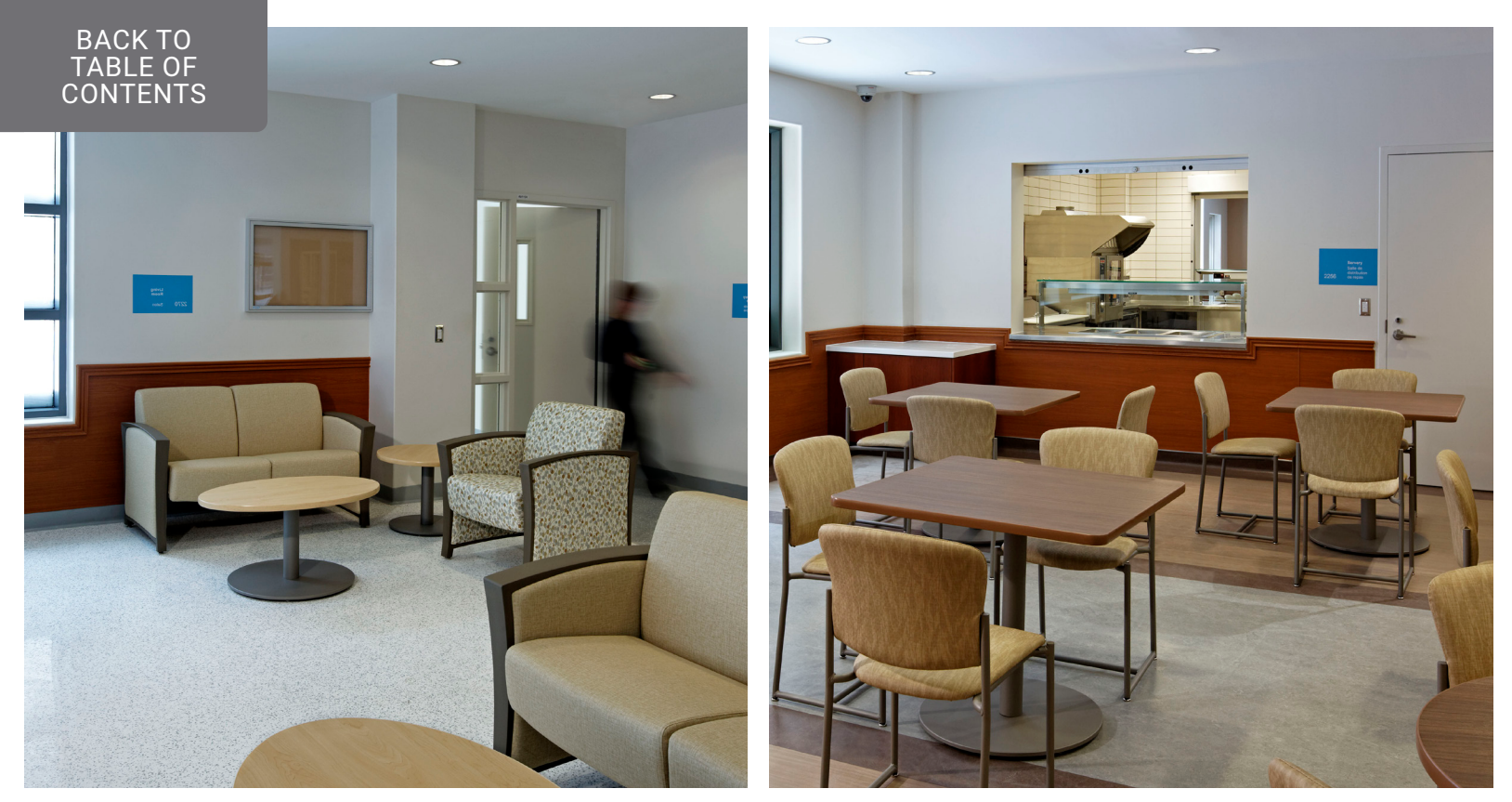
Lounge Area with Single and Two-Seater Dignity