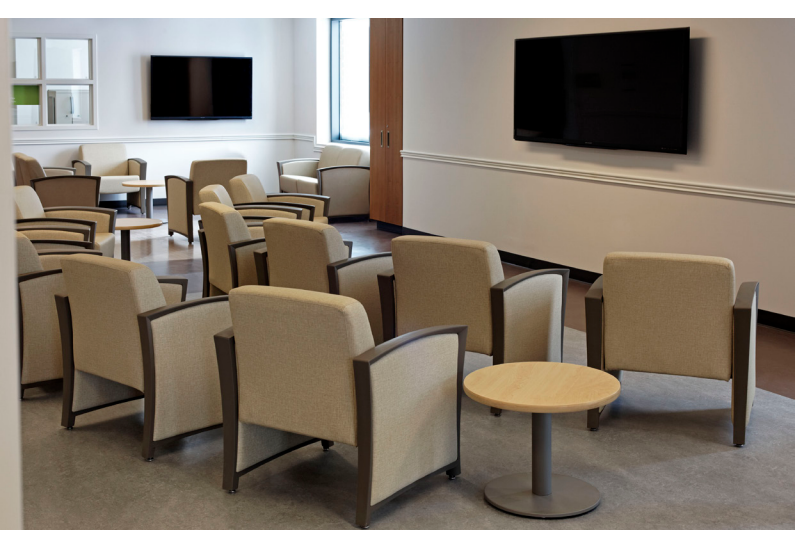
Theatre Room with Freestanding Dignity

With it's breathtaking views of Georgian Bay, the goal of the new Waypoint building was to emphasize patient healing in a safe and inclusive environment. A great deal of research and development went into the establishment in order to create a welcoming space for patients, with focus on creating an environment in which staff and patients can work and live cohesively.