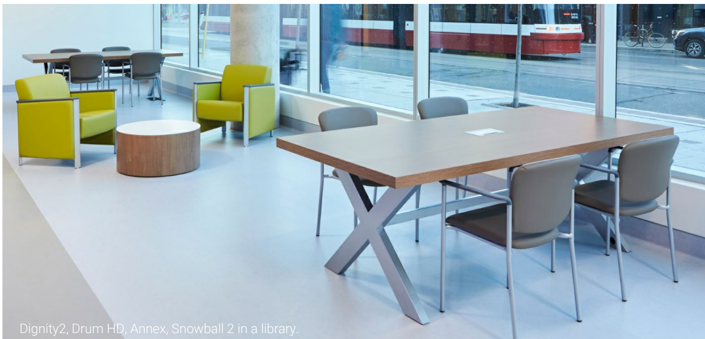
Dignity2, Drum HD, Annex, Snowball 2 in a library.

Rooms in the facility with the most privacy and least supervision include patient rooms and therapy rooms. Select roto-molded Hardy products are outfitted in these spaces due to their durable build and rounded edges with few pickup points. Hardy dining without arms is specified throughout the patient rooms, and Hardy Rocker in therapy rooms. Both products can be weighted with sand onsite if needed, and Hardy Dining can be fastened to the floor. Therapy rooms benefit from the soothing rocking motion of Hardy Rocker, which can aid in calming the patient. Constructed of polyethylene materials, Hardy is also used in a patient bathing suite. The durable nature of the roto-mold material provides an impervious surface.