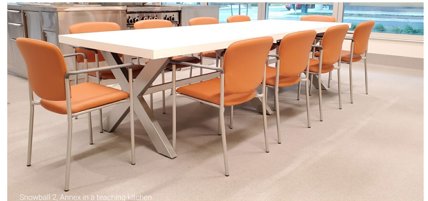
Snowball 2, Annex in a teaching kitchen