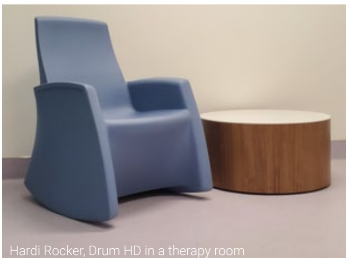
Hardi Rocker, Drum HD in a therapy room

While the new buildings now house patients and offer valuable mental health services and resources for the community, the project's next phase is underway.