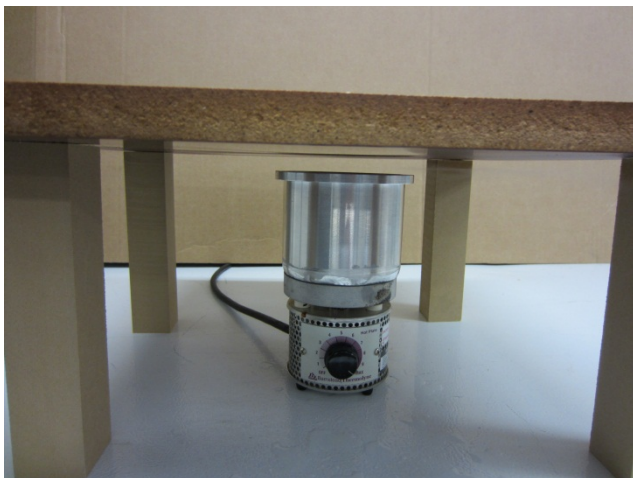
Figure 2 – Steam Exposure

8.3.3 Structure to hold the material ½-inch above the cup.