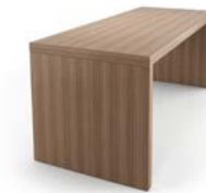
EndZone CT1, CT2 Page 35