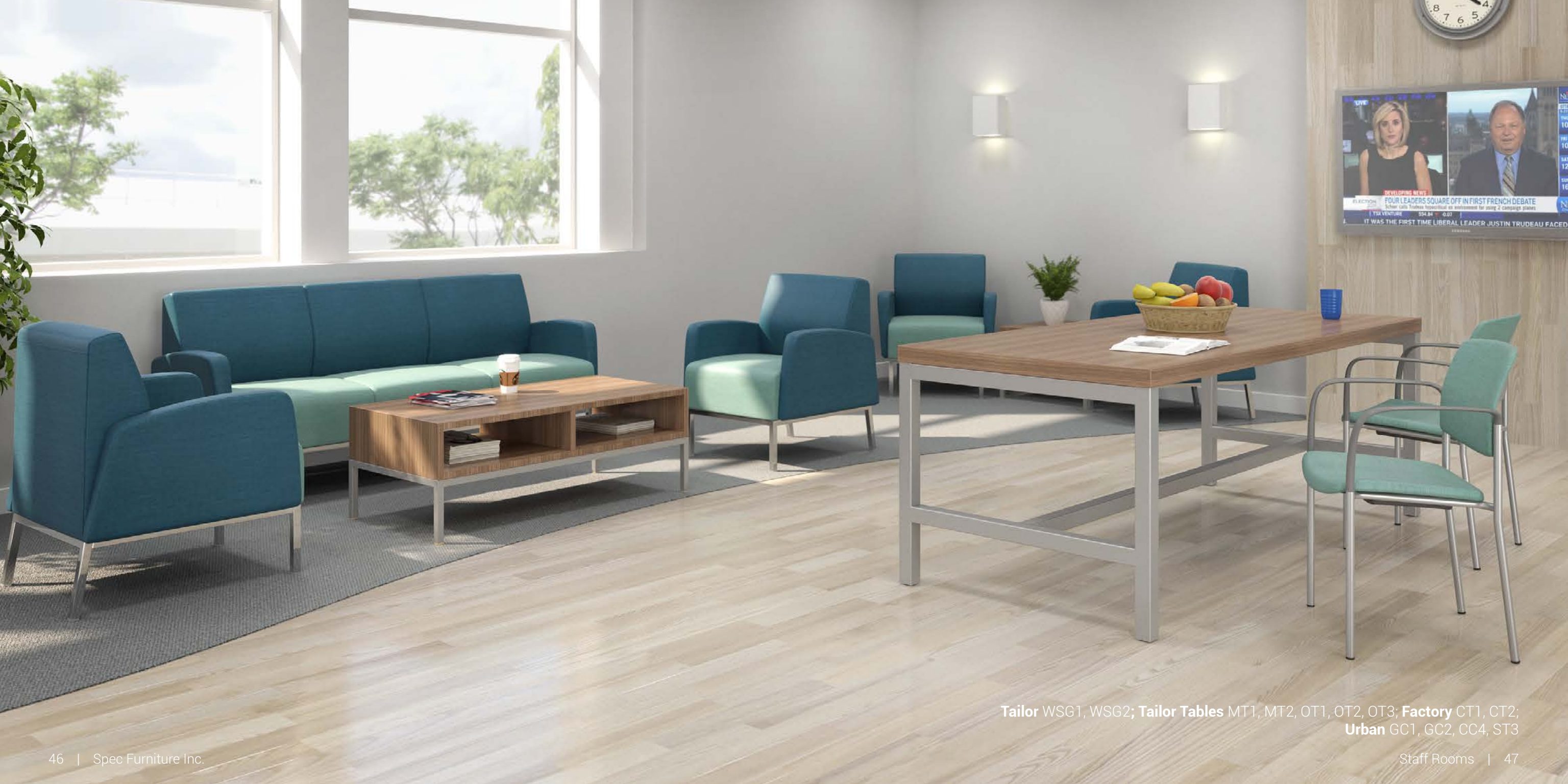
Tailor WSG1, WSG2; Tailor Tables MT1, MT2, OT1, OT2, OT3; Factory CT1, CT2; Urban GC1, GC2, CC4, ST3