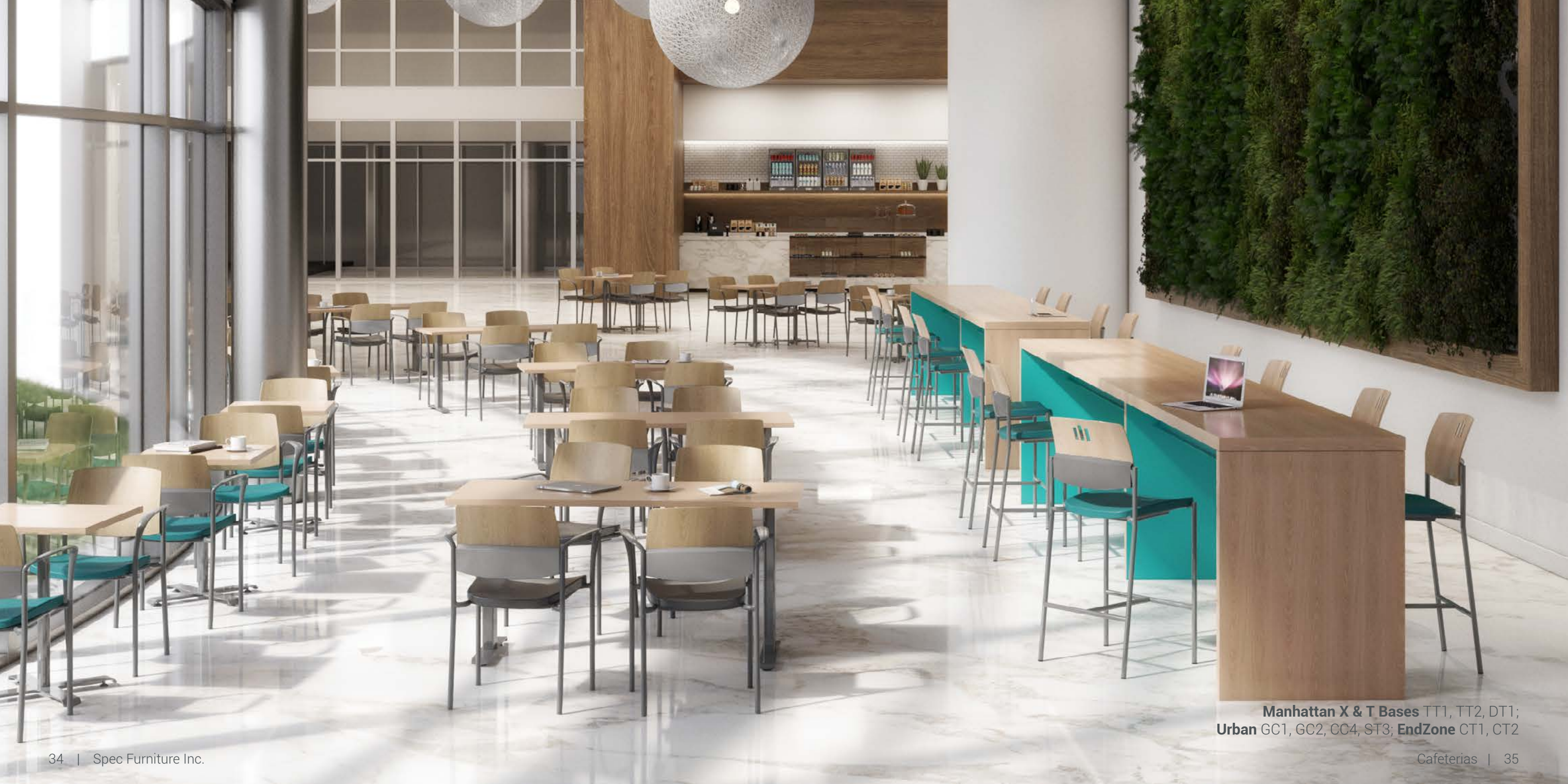
Manhattan X & T Bases TT1, TT2, DT1; Urban GC1, GC2, CC4, ST3; EndZone CT1, CT2