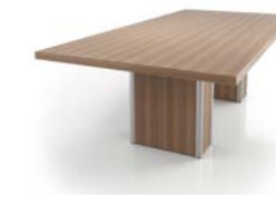
Boardgames CT1, CT2, DT1 Pages 30, 48