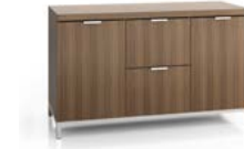
Credenza CR1, CR2 Page 48