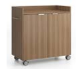
Hospitality Carts CH1, CH2, CM1, CM2