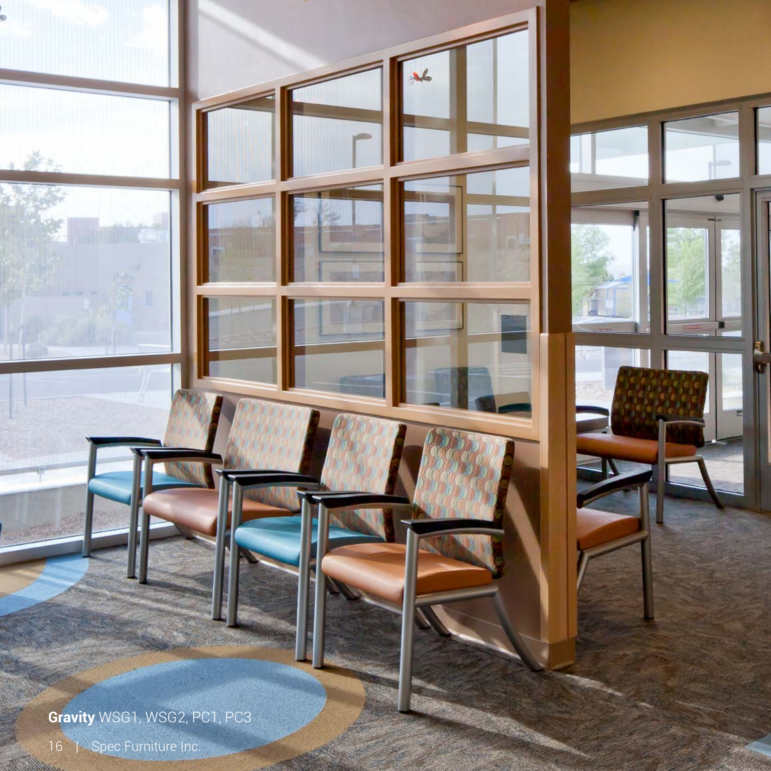
Gravity WSG1, WSG2, PC1, PC3