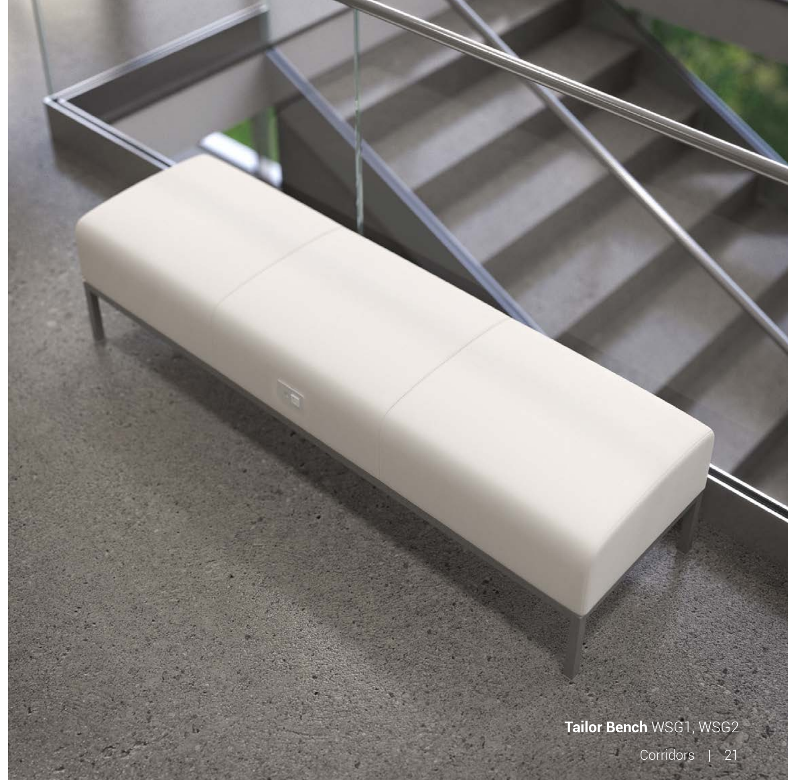
Tailor Bench WSG1, WSG2

Seating creates places to connect with each other or find moments of quiet retreat. With thoughtful design, Spec furnishes peaceful settings as well as functional, convenient spots where colleagues can convene.