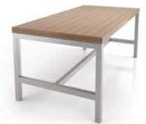
Factory CT1, CT2 Page 47