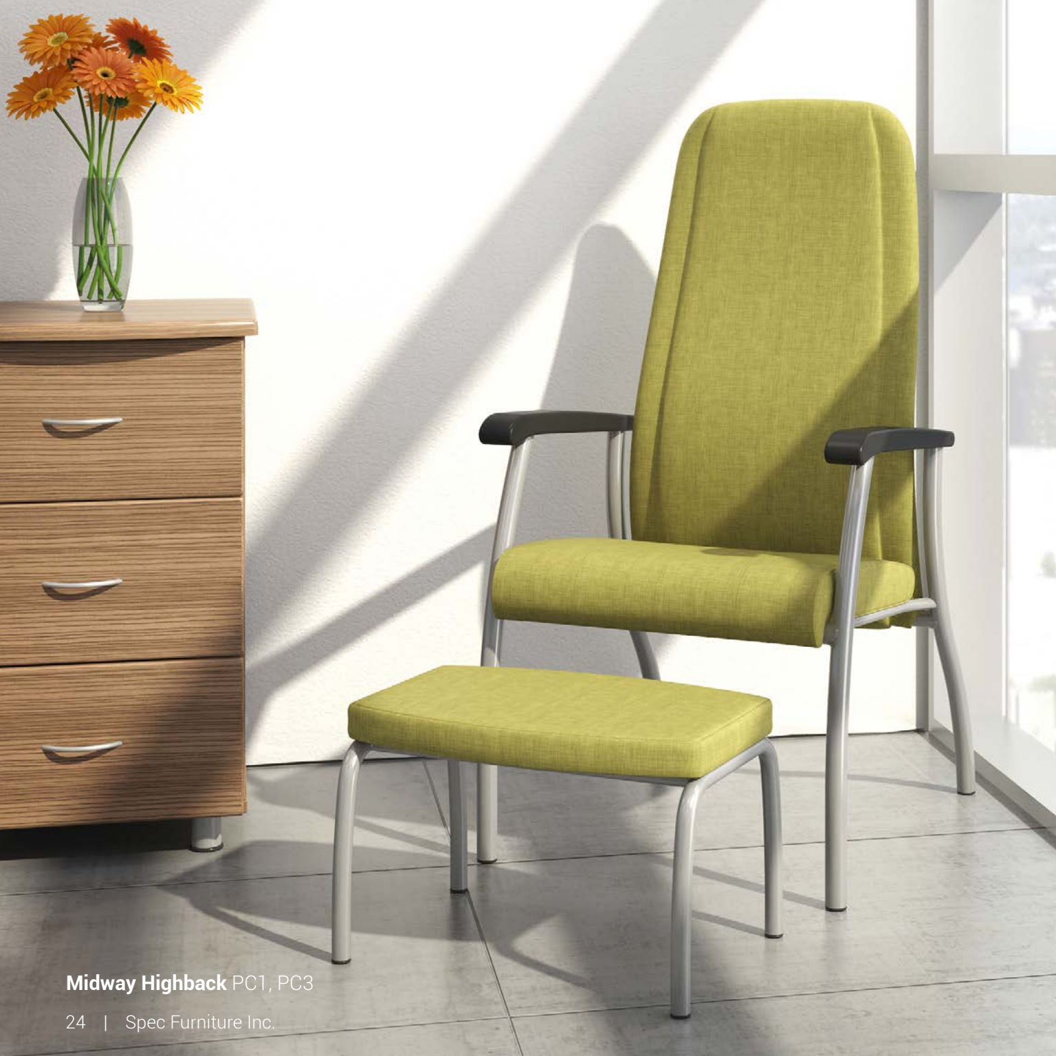
Midway Highback PC1, PC3