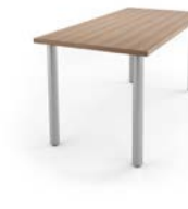
Post Legs DT1, TT1, TT2