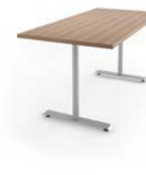
Manhattan DT1, TT1, TT2 Pages 34, 50