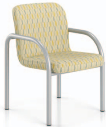
One-piece seat and back.