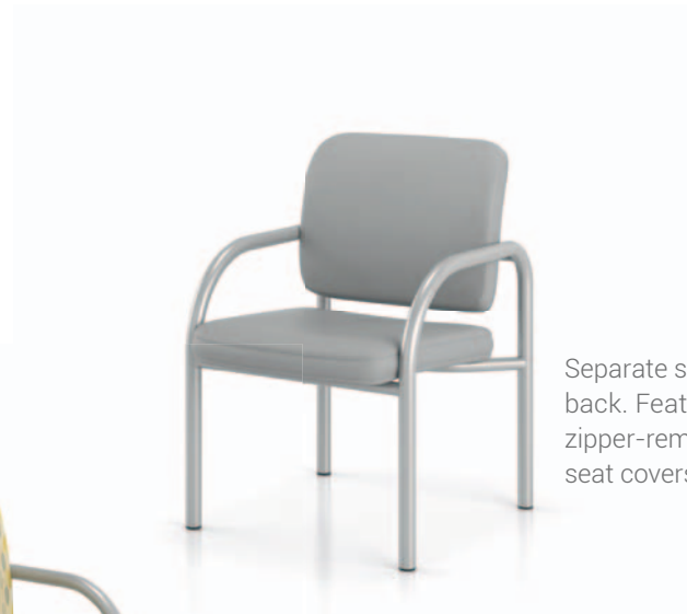
Separate seat and back. Features zipper-removable seat covers.