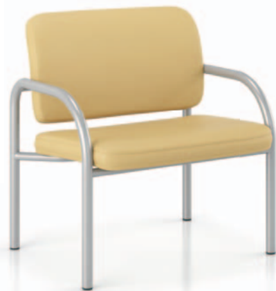
Bariatric available with separate seat and back only, and supports 750 lbs.