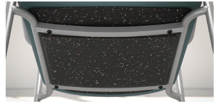
With a 100% recycled plastic seat pan and tamper-proof fasteners, Snowball HD has no exposed staples. Specify additional weight within the seat pan to restrict movement.