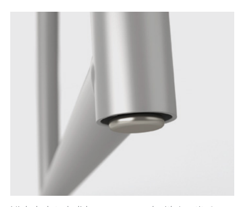
Nickel-plated glides are secured with Loctite®.