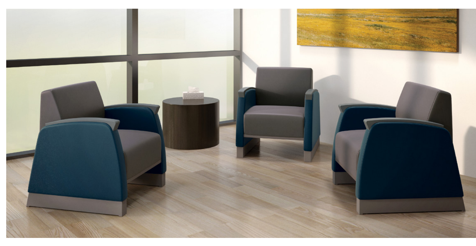
Tailor HD Seat and Back Upholstery: CF Stinson, Sentry-HC, Armada; Arm Panel Upholstery: CF Stinson, Sentry-HC, Midnight; Arm Cap: Sterling Grey; Foot: RAL 7037; Frame: RAL 7037. Drum HD Finish: Wilsonart, 7949K-18 Asian Night.

Designed and built to last, Tailor HD components are all replaceable. Polyurethane arm caps, available in black, sterling grey or taupe, can be specified to increase durability. Mix fabrics between the seat, back and arms at no upcharge.