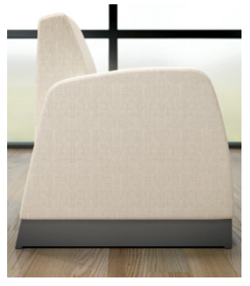
Tailor HD's arm panels extend fully to the floor to address ligature concerns while ensuring a wall-saving design.