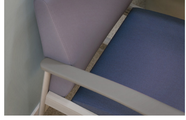
Field-replaceable seats, backs and arms make maintenance simple and efficient.