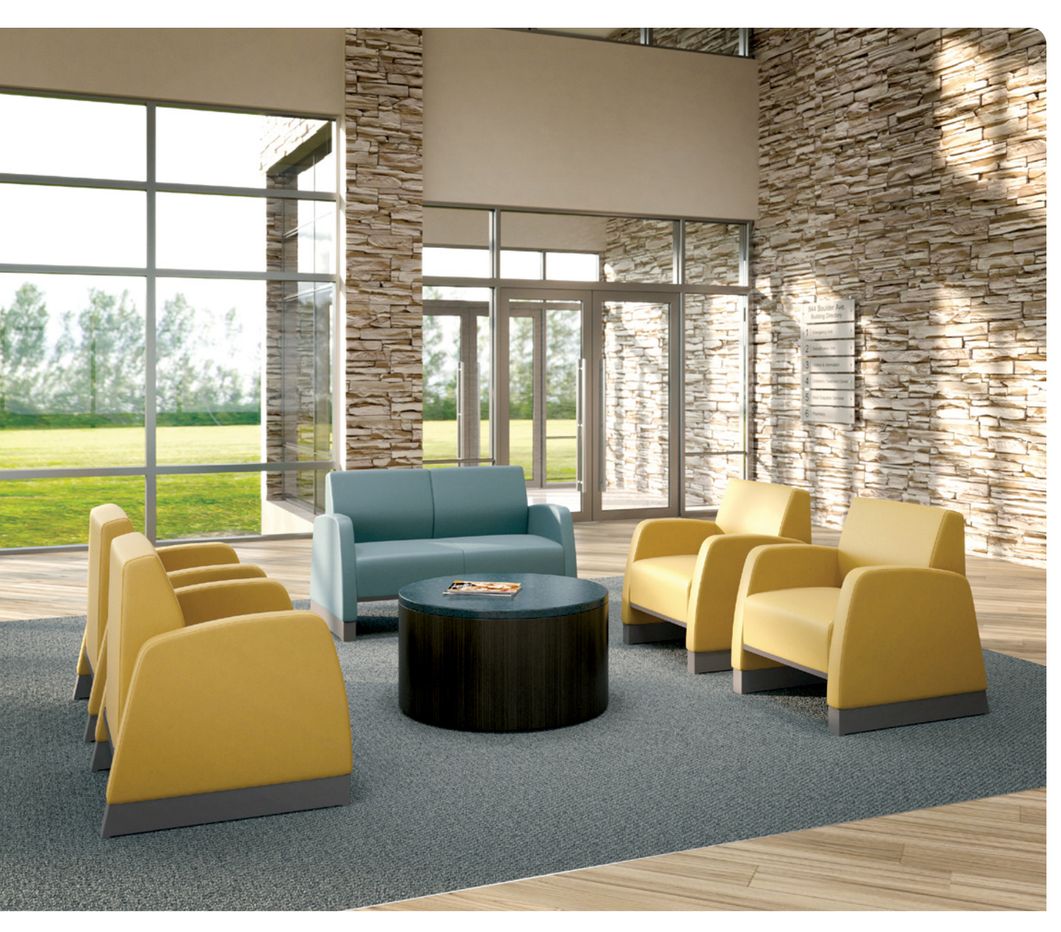
Tailor HD Upholstery (Blue): Morben, Vitality, Hot Spring; Upholstery (Yellow): Morbern, Vitality, Blonde; Foot: RAL 7037; Frame: RAL 7037. Drum HD Top: Corian, Blue Spice; Side Finish: Wilsonart, 7949K-18 Asian Night.