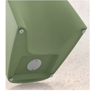
All Hardi designs can be weighted on site with sand, if desired. A spun-in cap on the underside closes the opening, secured with tamper-proof fasteners.