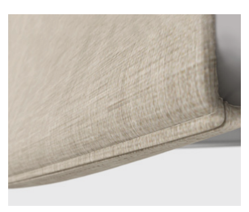
Zippers are secured and pulls are removed.