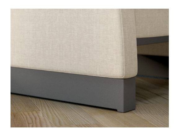
Tailor HD comes standard with a unique, one-piece, rotationally molded polyethylene foot that is extremely durable, tamper-proof, waterproof and capable of withstanding the harshest of cleaning solutions. Standard in grey to match RAL 7037.