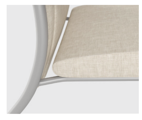
Separate seats and backs are available on most models.