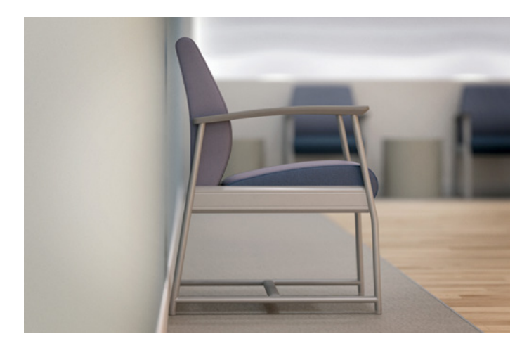
Calvin HD comes standard with a fully welded, wall-saving, steel-frame construction.