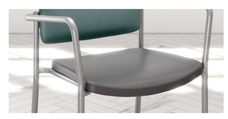
Snowball HD's optional DuraSpec polyurethane seat is extremely durable. Available in black or grey, it is designed to be both more comfortable than hard plastic and capable of withstanding the harshest of cleaning solutions. Specify Snowball HD with an 18" or 22" seat width, in designs with or without arms.