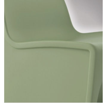
Shallow hand grips make Hardi designs difficult to pick up yet easy to adjust while seated.