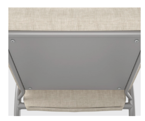
Several designs feature optional weighting to reduce ease of movement.

At Spec, we view Behavioral Health as a continuum of care. In collaboration with designers, facility managers and caregivers, we have developed—and continue to develop-robust Behavioral Health product lines that respond to the needs of patients within these organizations, and in more generalized health and wellness facilities. All of our seating designs have been dynamic load tested to at least 500 lbs. Our other standard design considerations can be seen here.