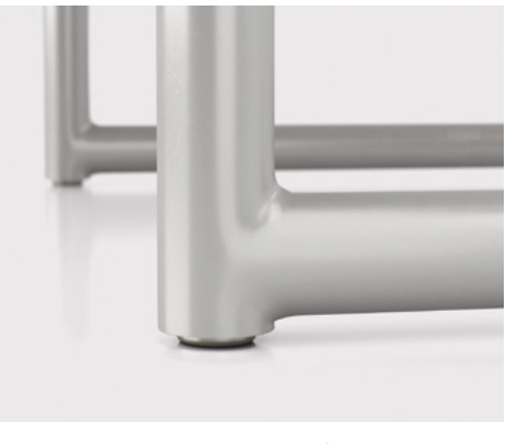
All metal connection points are fully welded.