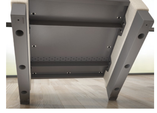
A standard steel plate on the underside eliminates all pass-throughs. The steel plate comes standard with small perforations between the seat and back to avoid trapping fluids.