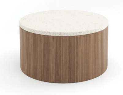
Table tops are available in solid surfaces to assist with infection control.