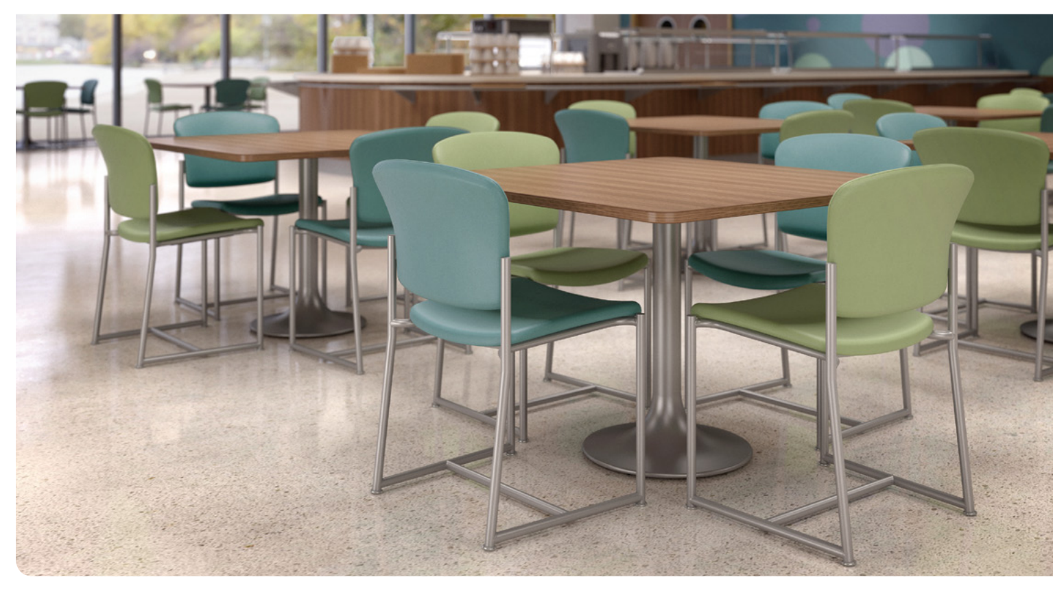
Snowball HD Upholstery (Blue): Morbern, Vitality, Hot Spring; Upholstery (Green): Morbern, Vitality, Willow; Frame: Silver. Trumpet HD Top Finish: Wilsonart, 7937-38 River Cherry; Edge: 2MM River Cherry; Base: Silver.

Snowball HD may share the friendly style of general purpose seating found in cafeterias, game rooms and examination rooms, but you can rest easy: with a dynamic load capacity in excess of 500 lbs and a fully welded frame, the series is built with Behavioral Health requirements in mind.