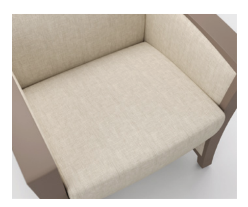
Seats feature springless construction.