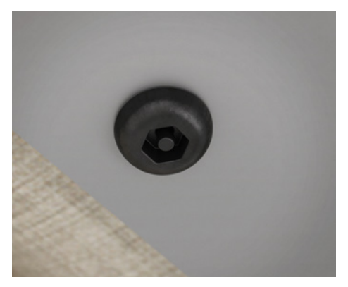
Tamper-proof fasteners are standard on all designs.