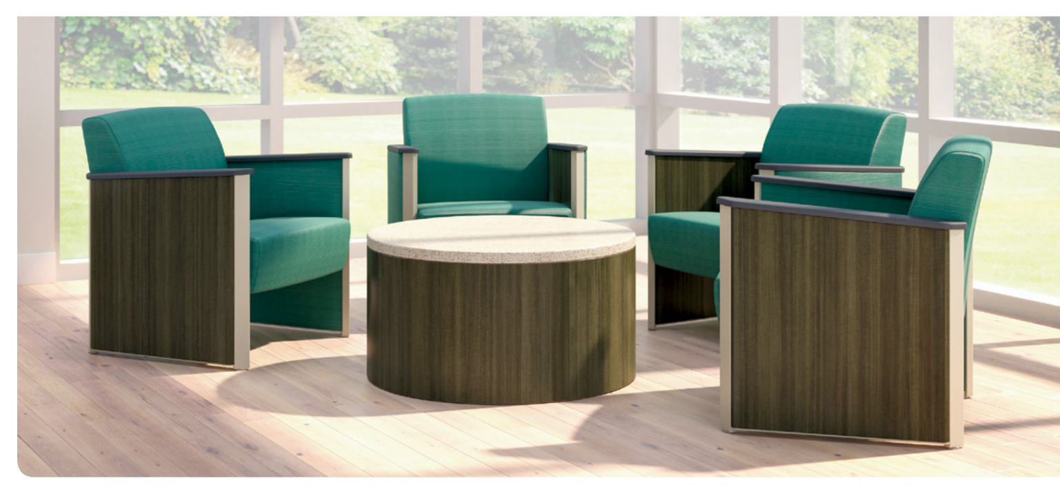
Dignity2 (Shown with Extended Side Panels) Upholstery: Momentum, Row, Oasis; Side Panel Laminate: Wilsonart, 7960K-18 Studio Teak; Arm Cap: Sterling Grey; Frame: RAL 7038. Drum HD Top: Corian, Savannah; Side Finish: Wilsonart, 7960K-18 Studio Teak.