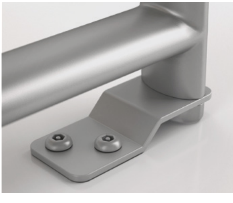
Optional floor mounting straps are available.