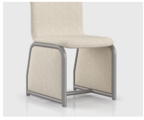
Customized solutions are available.