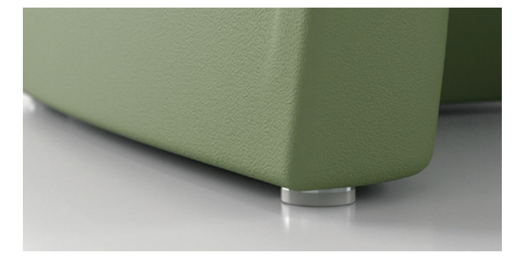
Nylon glides are optional. Hardi designs specified with glides can be fastened to the floor or ganged together.

Hardi Dining Armless Finish: RAL 6021. Hardi Dining with Arms Finish (Dark Grey): RAL 7015; Finish (Blue): RAL 5014. Disc HD Top Finish: Wilsonart, D354-60 Designer White; Edge: 2MM RAL 9016; Base: Silver.