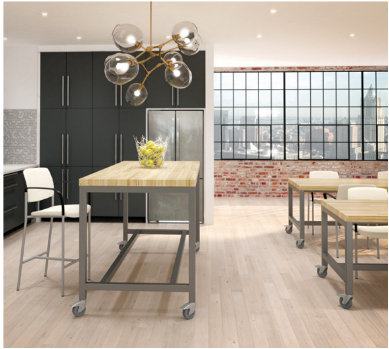
42" high table is shown with optional footrest.

Factory Table brings the option of mobility to collaborative areas. To support dynamic group tasks, Factory can be specified with glides or industrial locking casters; in a choice of sitting, bar and standing heights; and in a range of widths and lengths. Veneer and laminate tops can be specified as a 2" built-up self or 2mm edge. Optional 1 3/4" thick solid wood tops are also available.