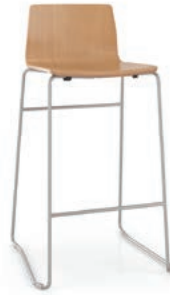
2147 JAZZY BAR HEIGHT