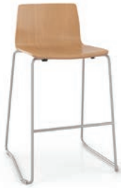
2144 JAZZY COUNTER HEIGHT