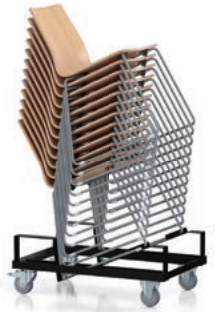
2199 JAZZY DOLLY