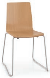
2141 JAZZY DINING HEIGHT