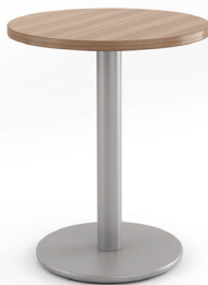
Weighted Disc Base