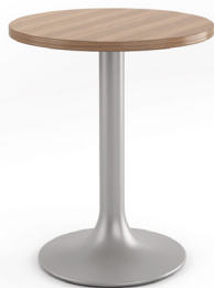
Weighted Trumpet Base