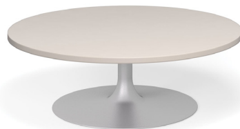
Weighted Trumpet Base Lounge Height