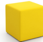
2502 23 lbs