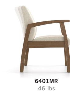
6401MR 46 lbs

Exceeds BIFMA Seating Durability Test to 350 lbs per seat CAL 133, add $115 List per seat