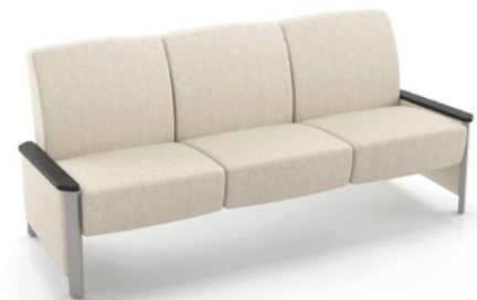
4603M-N 205 lbs

For KYDEX® arms add suffix K and $244 Dynamic load tested to 1000 lbs per three seater