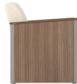
Side panel extended to floor