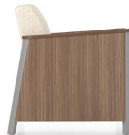
Wall-saving side panels