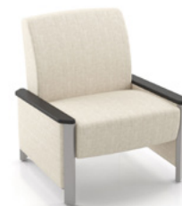
4601M-N 95 lbs

For KYDEX® arms add suffix K and $244 Dynamic load tested to 500 lbs per chair