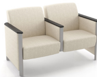
4612M 150 lbs

For KYDEX® arms add suffix K and $366 Dynamic load tested to 750 lbs per two seater