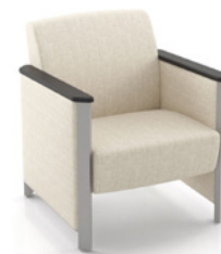
4601M 95 lbs

For KYDEX® arms add suffix K and $244 Dynamic load tested to 500 lbs per chair