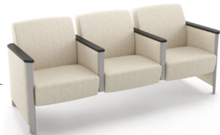
4613M 205 lbs