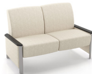
4602M-N 150 lbs

For KYDEX® arms add suffix K and $244 Dynamic load tested to 750 lbs per two seater