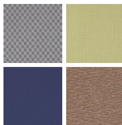
Select fabrics from one of our textile partners