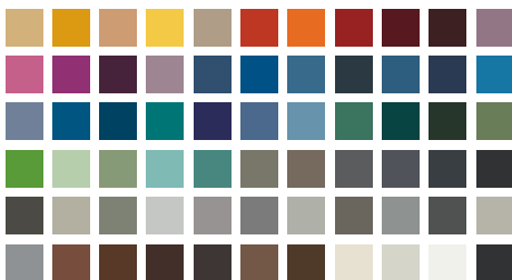
Select from one of our 76 standard Spectone colors